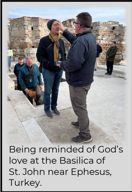
Being reminded of God's love at the Basilica of St. John near Ephesus, Turkey.