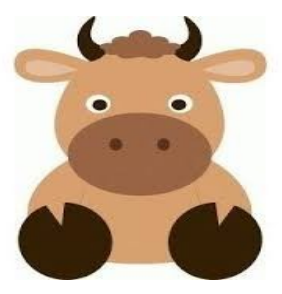
Page 2 Rev.11/2021