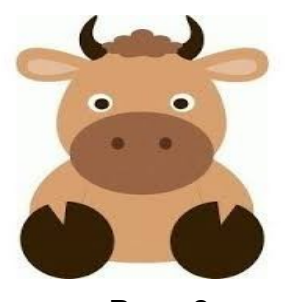
Page 2 Rev. 9/2021