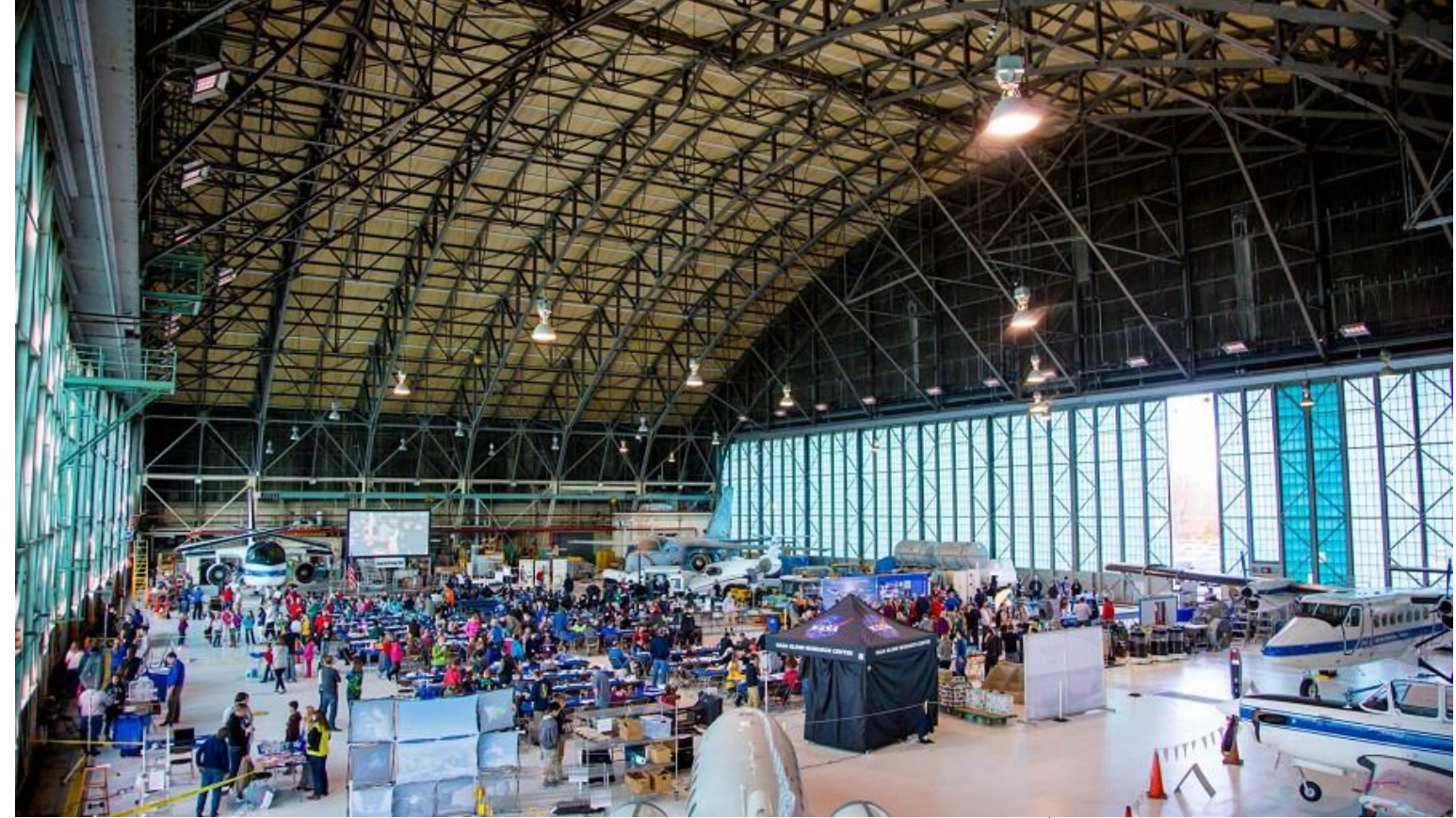
Over 350 students and more than 70 volunteers gathered in the NASA Glenn Research Center hangar for the 23<sup>rd</sup> Annual Young Astronaut Day.