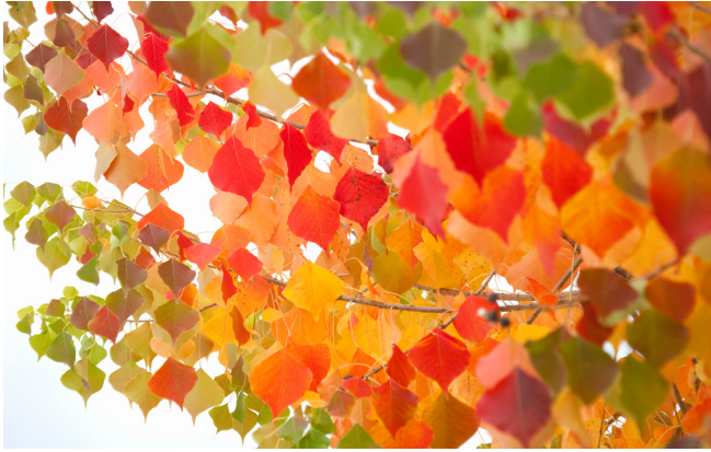
Chinese Tallow Trees (aka Popcorn Trees)

Known for their "popcorn white" seed pods and spade-shaped leaves, the tallow was introduced to the US so that southern states could have a soap-making industry. Now, their oily seeds are a leading source of biodiesel.