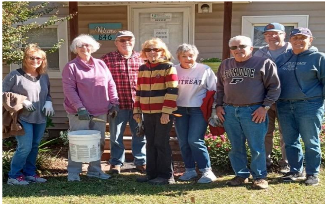
First Presbyterian Church cleaned up the grounds