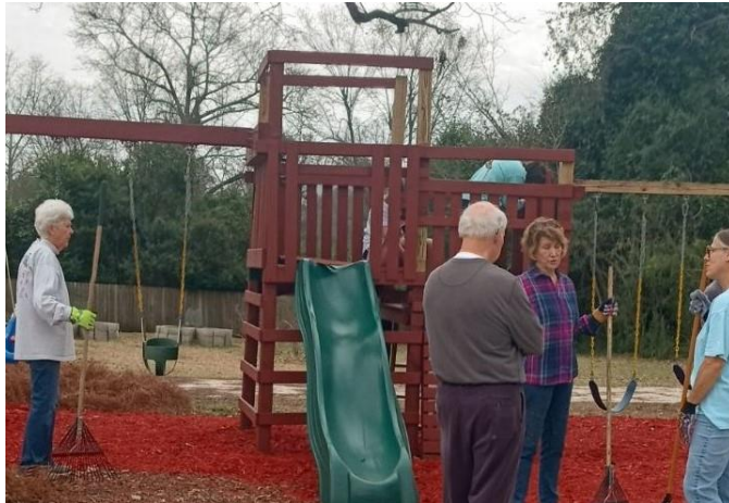
St. John's United Methodist volunteers spruced up our children's playground