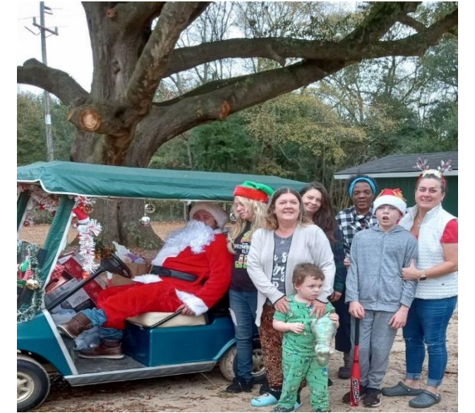
Christmas was extra special when Santa Claus delivered a golf cart load of gifts to the ladies and children this year from Midland Valley Church of the Nazarene and Calvary Chapel.