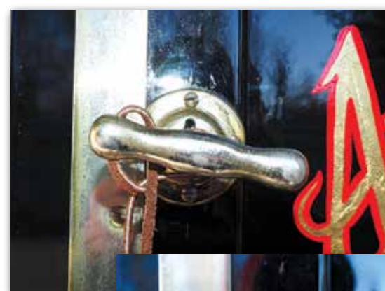
The Pie Truck has a unique back door lock. The key (handle) hung on a lanyard around the driver's neck. After placing the key in the lock, he turned it clockwise to release the deadbolts - one at the top of the door and one at the bottom - to allow the opening of both doors. Pies had to be kept under lock and key because if a driver ever turned his back, they would disappear!