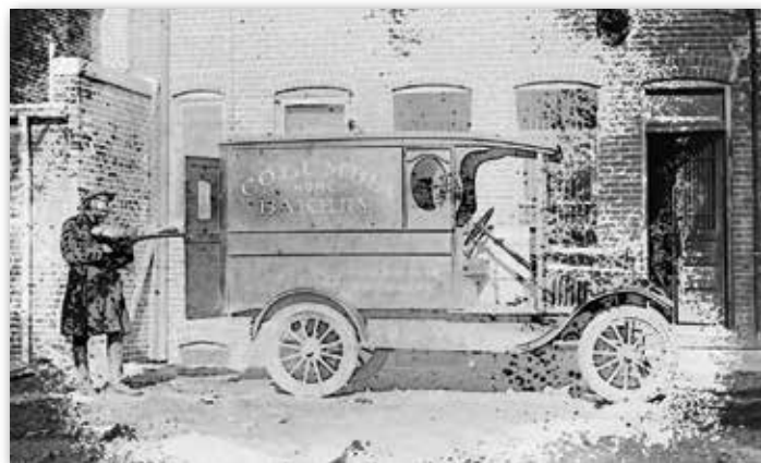
Although hard to see, this Atlas-bodied Model T Pie Truck was used by Columbia Bakery, an annex of our company.