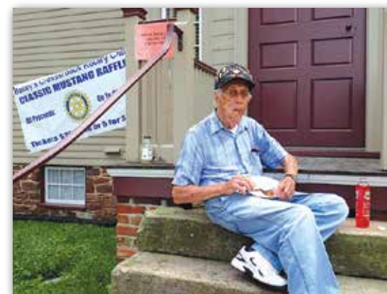
The annual Sully Antique Car Show held on Father's Day in Fairfax County, Virginia.