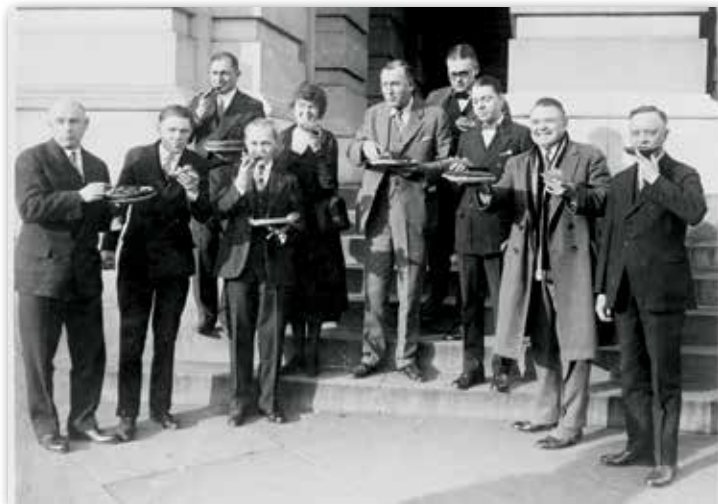
MODEL T TIMES, JANUARY/FEBRUARY 2017