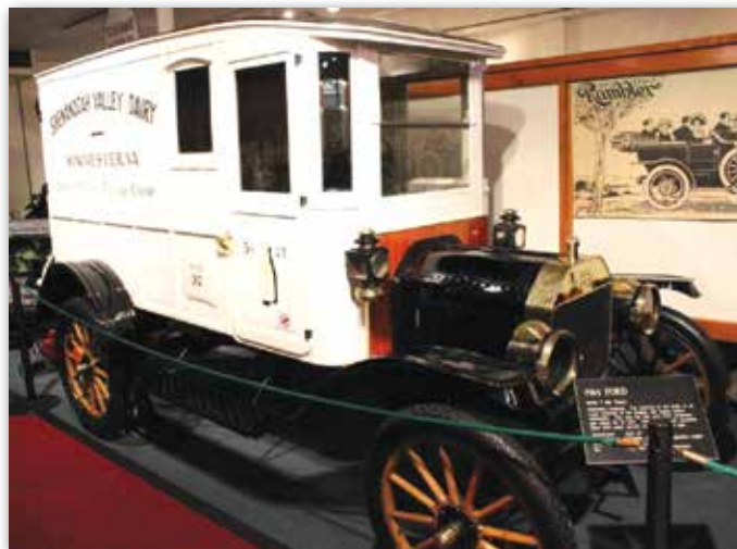
This Atlas-bodied Delivery Truck is on display at the Car and Carriage Museum in Luray, Virginia. It was ordered at the same time as the Copperthite Pie Truck and used at the Shenandoah Valley Dairy in northwestern Virginia.