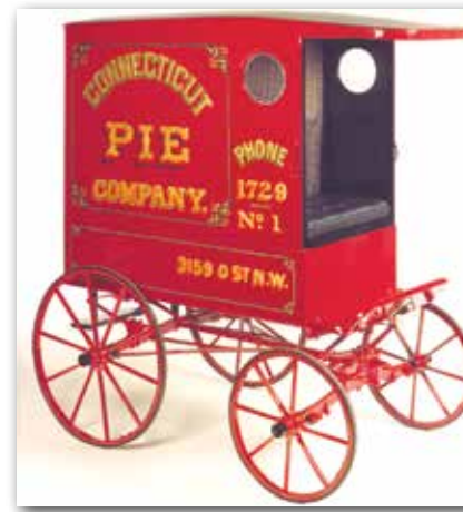
Above: One of the original horse-drawn wagons, which is now on display at the Smithsonian Institution in Washington, DC.