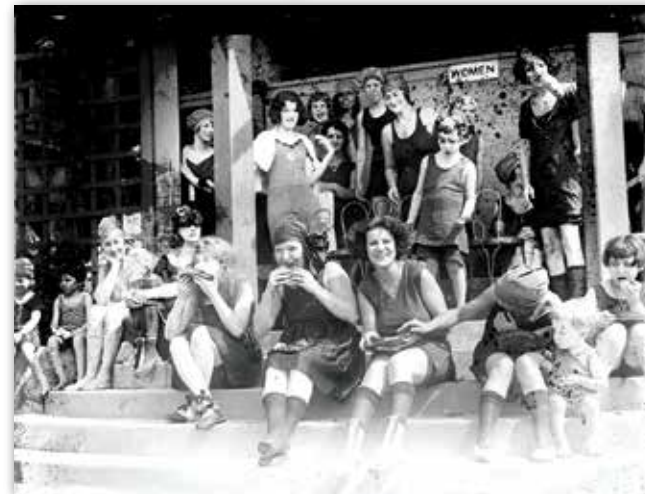
Ladies take a snack break at the tidal basin bath house, now the tidal basin along the Jefferson Memorial in Potomac Park where the cherry blossoms bloom each spring. Circa 1923.

Today, the Pie Truck serves as the "Pie Ambassador" at charitable events by giving and serving those in need. Proceeds from every pie sale go to seniors, students, and the homeless in our community and our country. It is our honor to serve the Veterans and organizations that have given so much. Just like in the vintage picture to the left, pie still makes people smile!