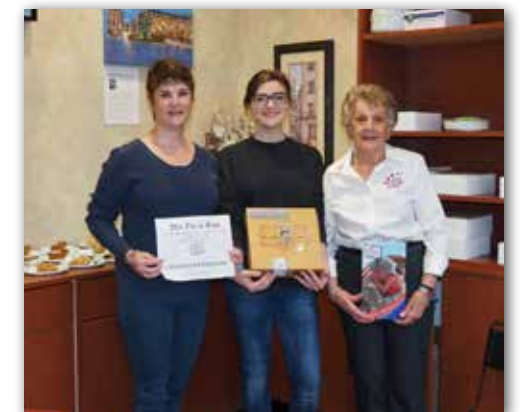
Preparing pies for donations, with proceeds going to Our Military Kids, Inc.