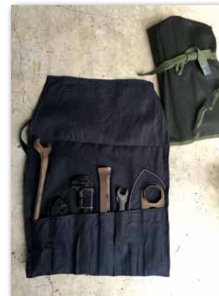
These tools are original to our delivery trucks. My grandfather gave me a bag of tools as a kid and told me they came from the Pie Trucks. Only the hubcap wrench is original to this truck.