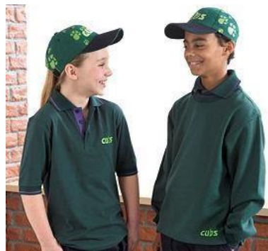
Cub Scout Uniform