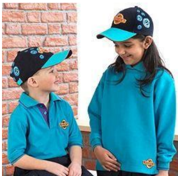
Beaver Scout Uniform

The section leader will let you know when your child is to be invested, so that you can purchase a uniform in readiness. The leader will also advise you as to what parts of the uniform are mandatory and which are optional