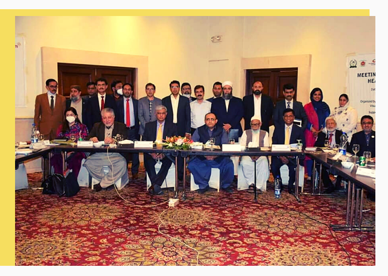
Glaucoma Awareness Week.

World Glaucoma Week is a global initiative of the World Glaucoma Association (WGA) in order to raise awareness on glaucoma.