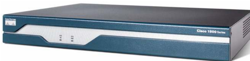
Figure 1. Cisco 1800 Series Integrated Services Routers

Support of high-density WICs (HWICs) is optional.