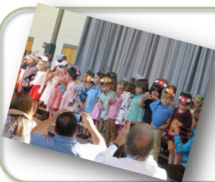
Celebrating Thanksgiving the All Saints Way