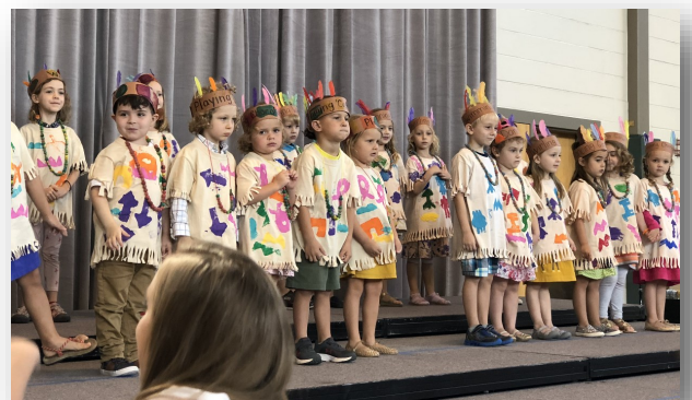
Thanksgiving Feast performance