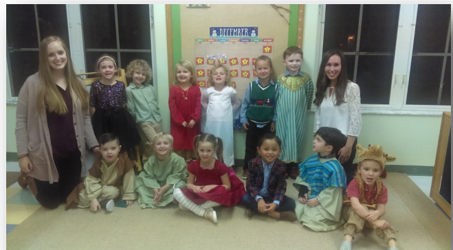
Christmas Pageant 2018