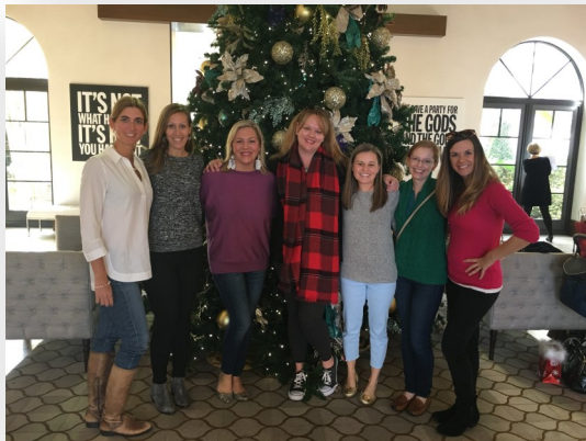
The Fellowship Friday group kicking off the holiday season with its annual holiday brunch

Watch your emails in the next few weeks for some exciting events coming up soon and lots of opportunities to get involved! The PTO will kick off the new year with a Mom's Night Out on Thursday, Jan 17 th 7 – 9 pm , location Parkview on Park Avenue. Then, the St. Jude's Trike-a-Thon will be January 23 rd . We will need lots of volunteers to help children decorate their bikes and cheer them on! You will also be hearing more about literacy week Feb