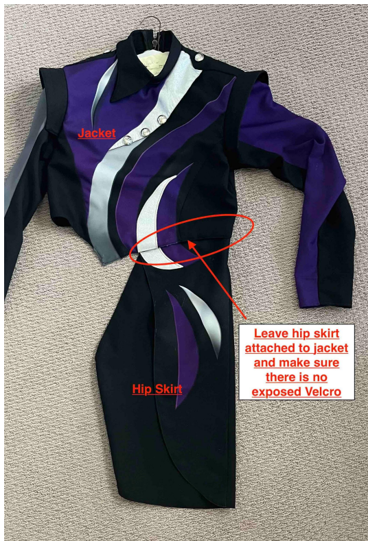
Figure 1: Jacket and Hip Skirt