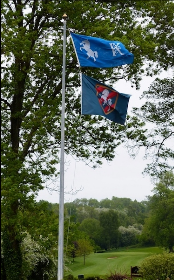
Strong winds at West Kent G.C.