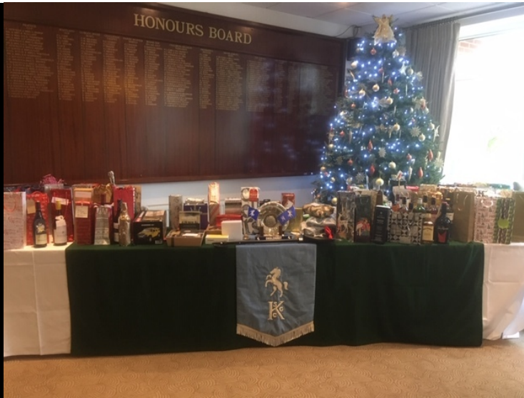
Christmas Fayre Prize Table

presented to everyone as a memento of the day.