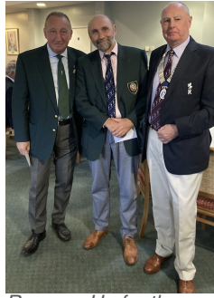
Runners Up for the Rochester and Cobham Park Trophy