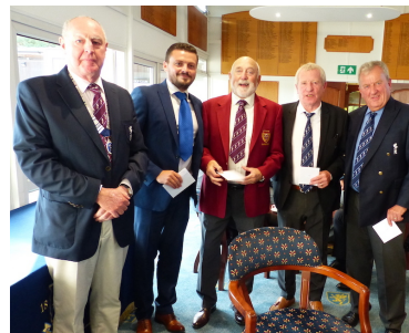
3rd Place Eltham Warren 1.