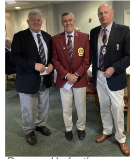
Runners Up for the Wildernesse Salvors