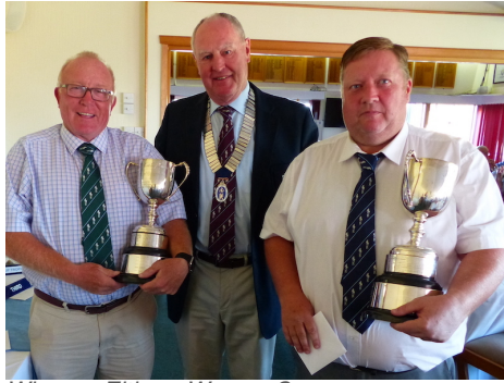
Winners Eltham Warren Cups.