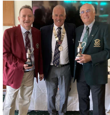
Winners 10th Tee Greensomes