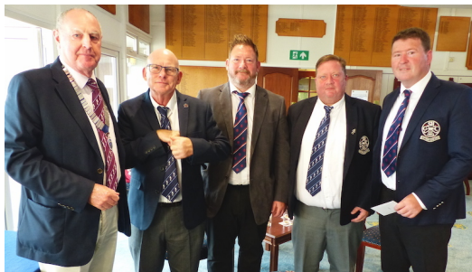
Runners Up, Shooters Hill