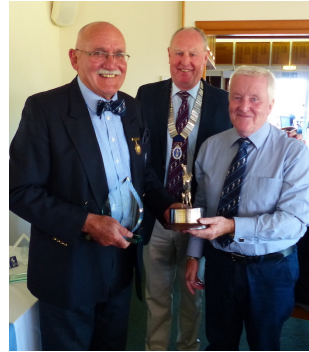
Winners The Sidcup Trophy