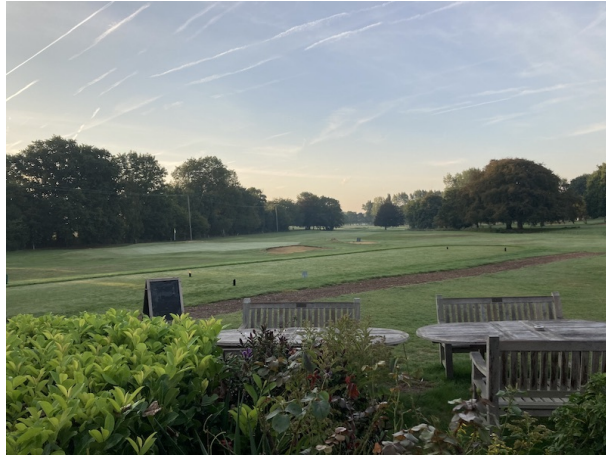
Early Morning at St Augustines G.C.

We ended the summer programme of golf as we started in glorious sunshine. Our hosts St Augustines Golf Club treated us, as we have come to expect, with great service wonderful food and an immaculate course, one must feel sorry for those members who could not join us to see off the summer in such a befitting manner.