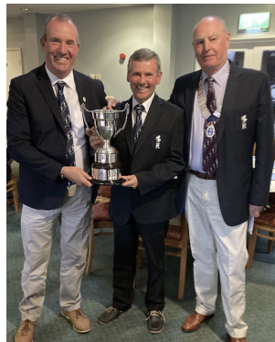
Winners of the Rochester & Cobham Park Trophy

Our Compliments to the chef for a wonderful buffet and to the house staff for excellent service.