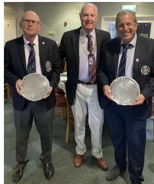
Winners of the Wilderness Salvors