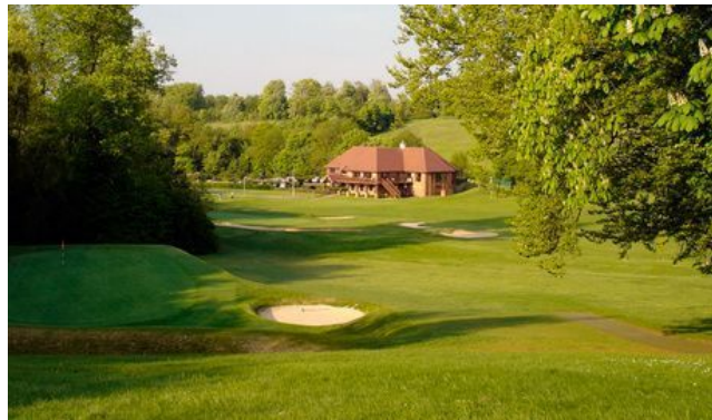
Faversham G C in warmer months

A very cold Faversham GC played host to our last members event this year; the Christmas Fayre. Unfortunately, due to the frozen course and greens we played on 18 temporary greens and buggies were not allowed for the day.