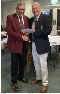
Runners Up for the Langley Park Salver