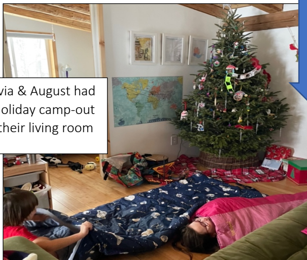
Sylvia & August had a Holiday camp-out in their living room

Tim & Peg camped- out next to the wood stove in the kitchen when the electricity was out last month. On the opposite side are big windows to see stars through (if the clouds ever let them). They liked it so well, they've been doing it ever since.