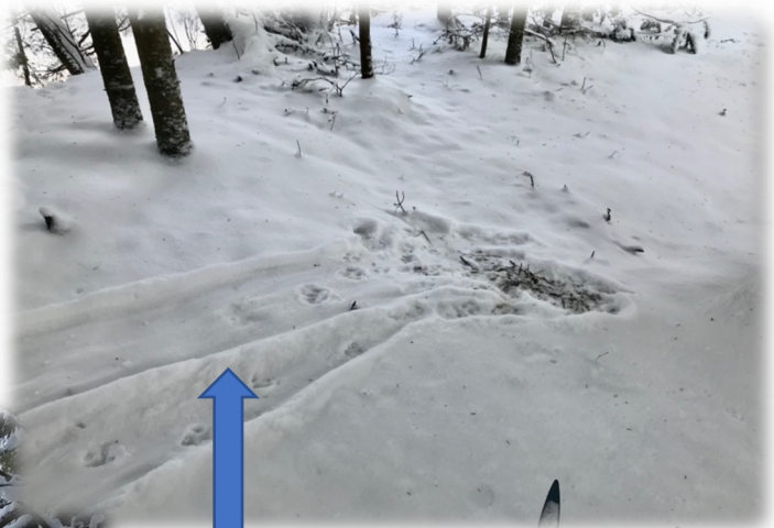
We think that this animal trail alongside Black Creek was likely made by Beavers because of their wide tail.