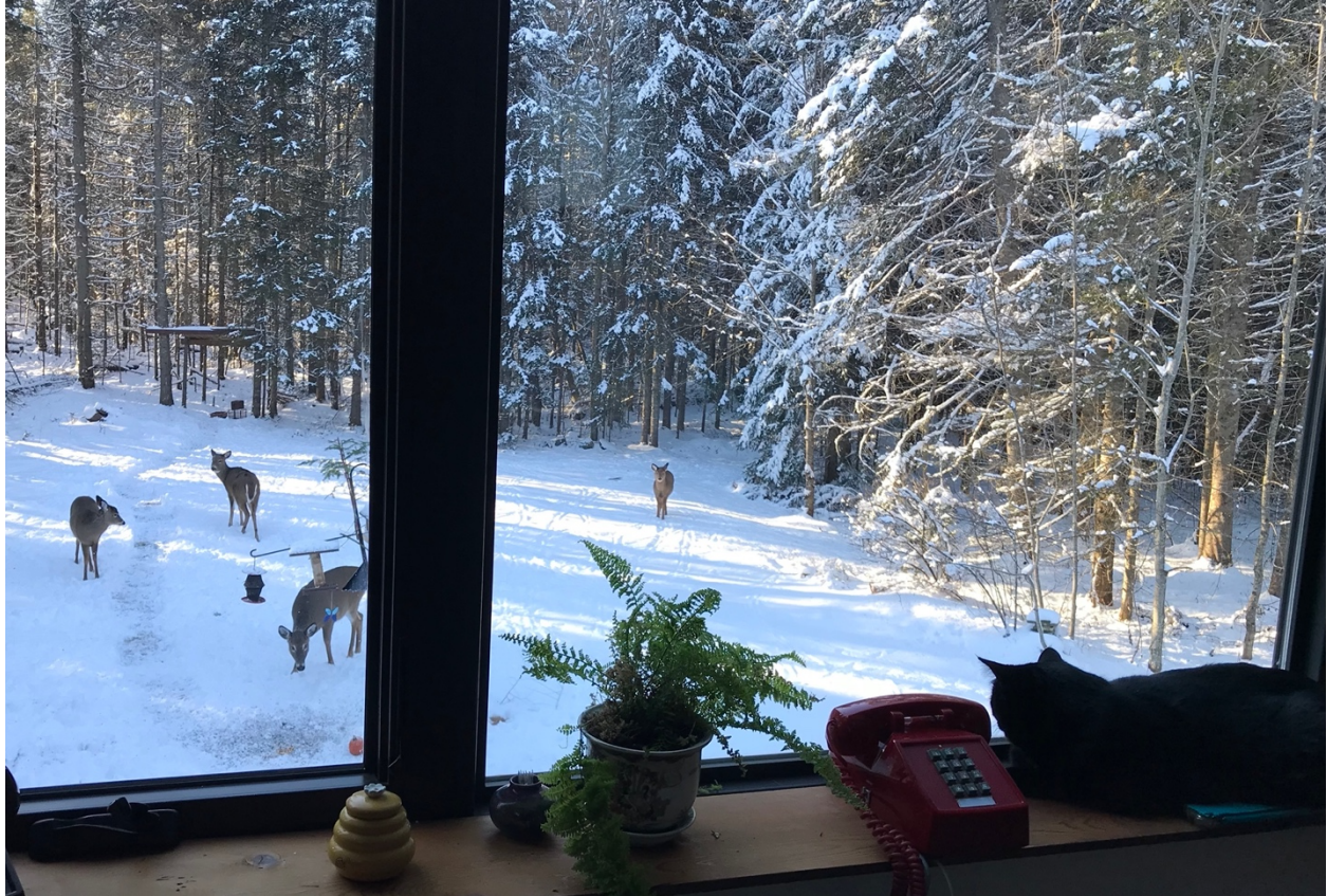
Our view while writing Nuggets Newsletter