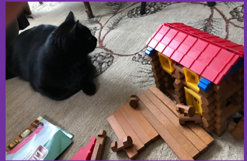
INK the kitty, approves of the construction, but looks appalled (and guilty) when it collapses. "I only touched it!" she claims.