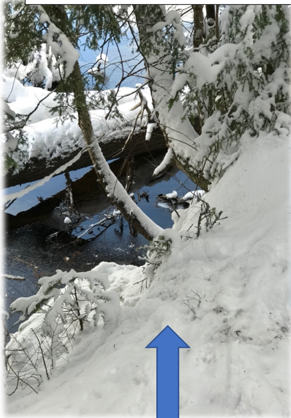
We strongly suspect that this animal trail which goes down a steep bank to the creek is made by Otters.