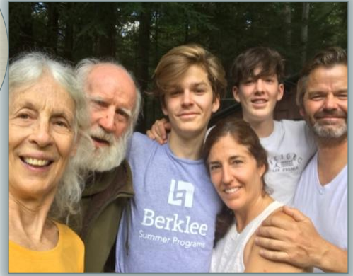
FAMILY FROM SPAIN

SNP HAS VISITORS FROM ALL OVER THE WORLD!