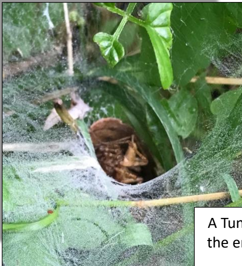
A Tunnel Spider makes its nest at the end of its silken tunnel out of a dried leaf.

DIVERSITY; The art of thinking independently together. (Malcolm Forbes)