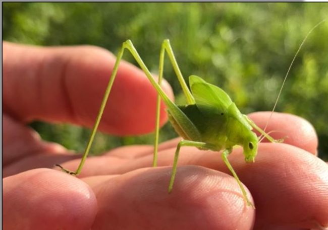
A very green grasshopper of some sort.

DIVERSITY; The art of thinking independently together. (Malcolm Forbes)