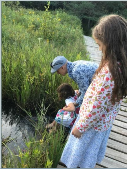
FAMILY FROM GERMANY

SNP HAS VISITORS FROM ALL OVER THE WORLD!