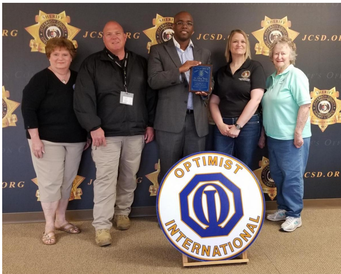
2021 Respect for Law presentation