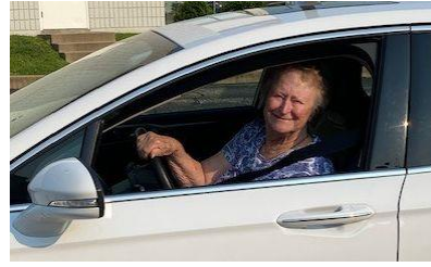
Coming through the White Castle Drive to support fund raiser.