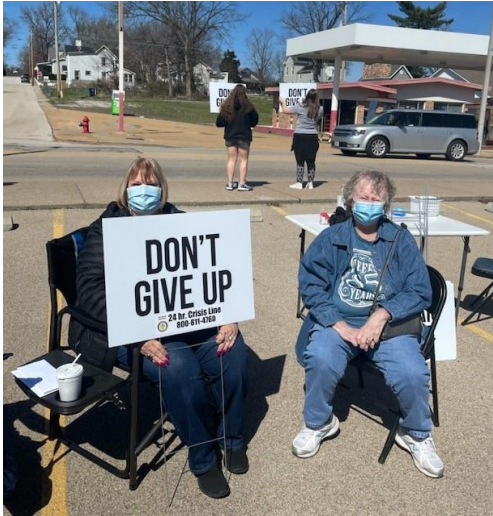
JOI Club "Don't Give Up" sign project.