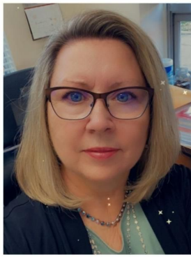
Cynthia R. Cherry CPA, LLC