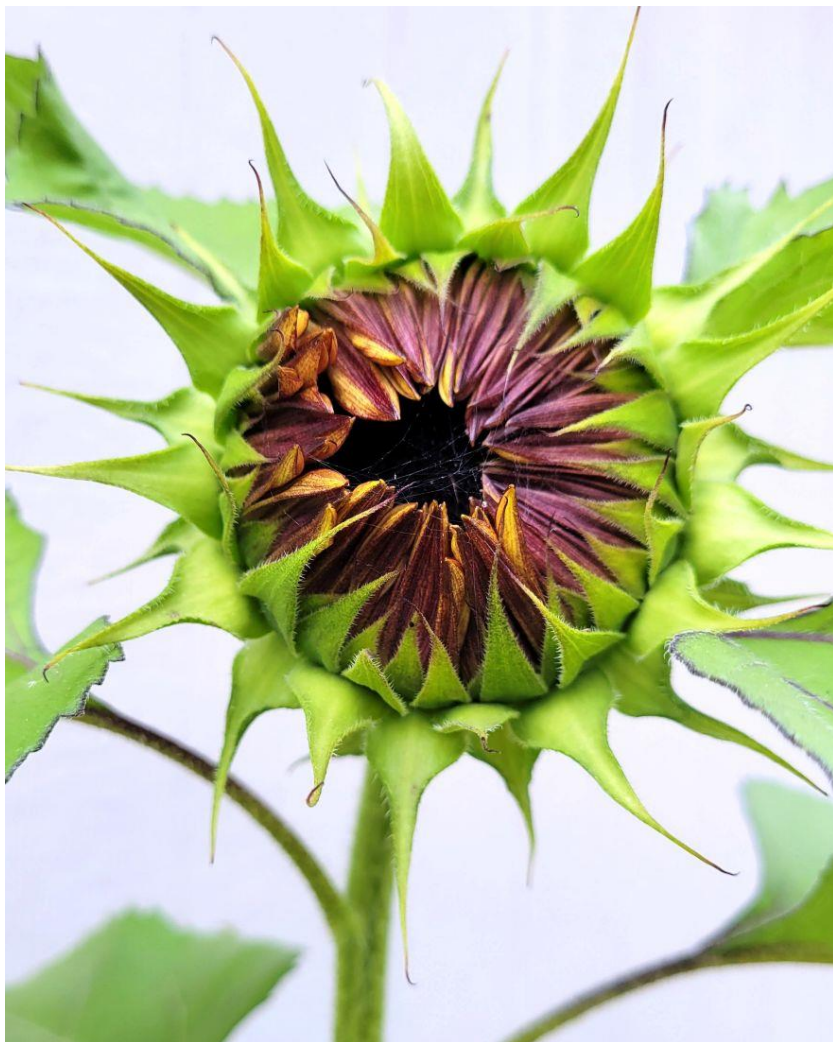
Eye of the Sun / Evelyn M Inception Finalist