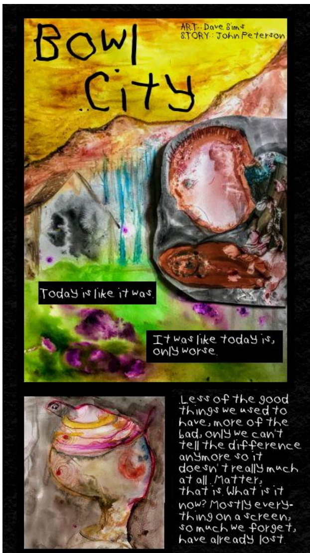
Bowl City Splash Page / Dave Sims