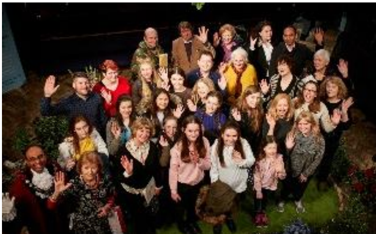
ENTRANTS OF A PREVIOUS COMPETITION