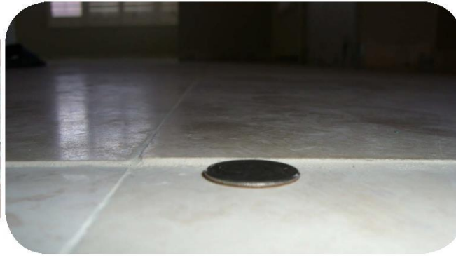
LIPPAGE (UNEVEN TILES)