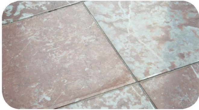
DIRTY, STAINED GROUT LINES