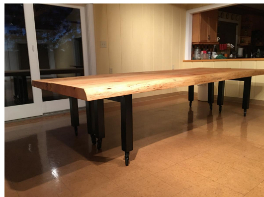
The two tables fit perfectly together. Working together to design the