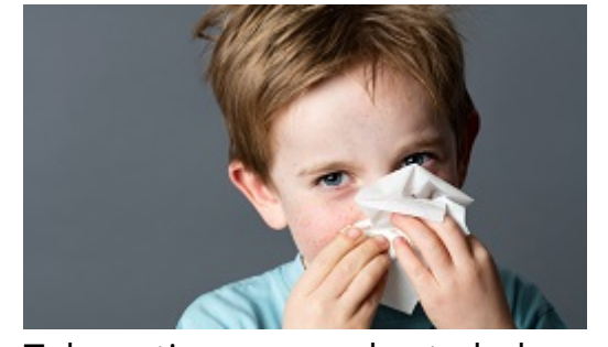
Take actions every day to help stop the spread of germs. Getting