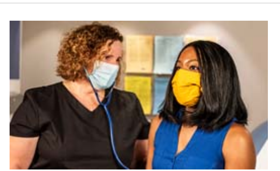
There are prescription medications called "flu antiviral