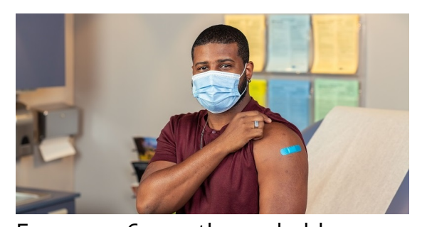
Everyone 6 months and older should get a flu vaccine every