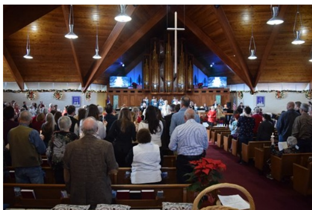
Christmas Eve Service