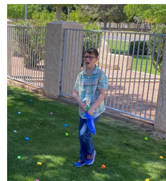
Easter Egg Hunt — 4/9