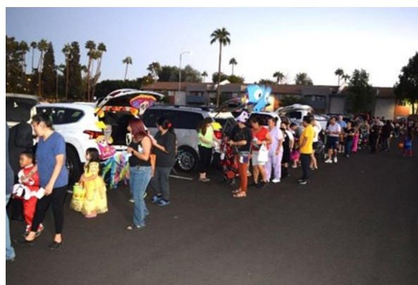
Trunk or Treat at Fall Fest – 10/28