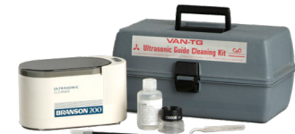
EDM Miscellaneous Consumables

Available Nozzle Sizes: Single 1.0mm ` 5.0mm Double: 4 hole ~ 24 hole