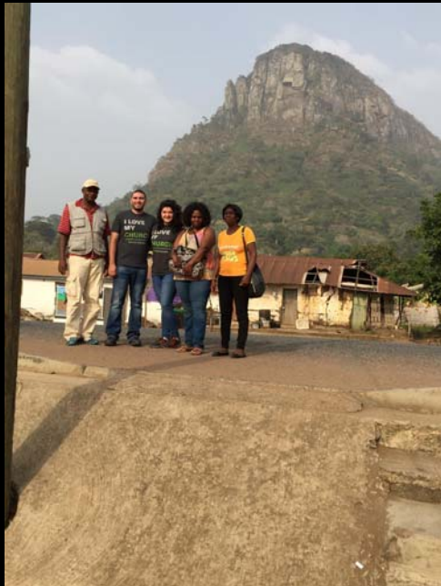
Other side of the river