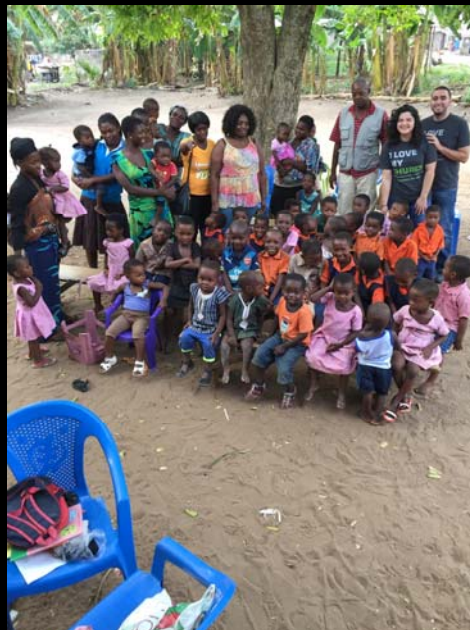
Under a tree