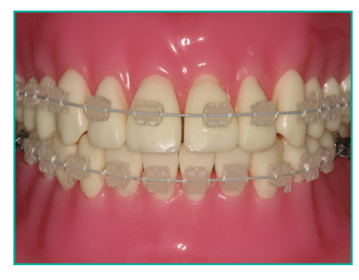
7. Rinse and check your teeth in the mirror your teeth and braces should be clean and shiny. These teeth are spotlessly clean. Keep yours that way and you will have a beautiful smile when your braces are removed.