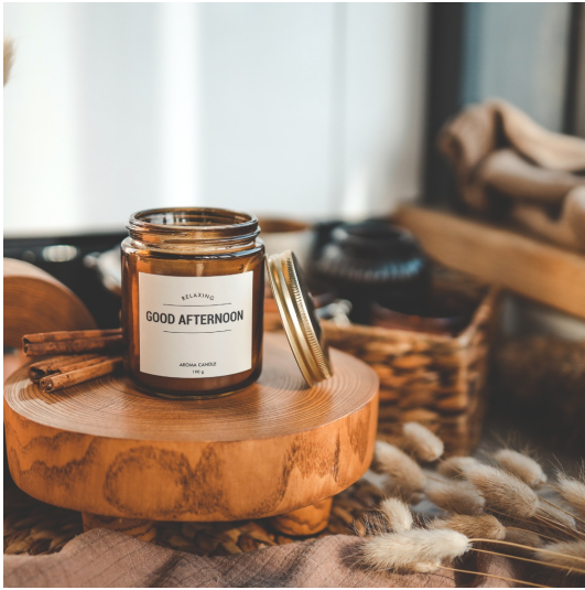
2024 Design Trends

This spring, experts predict home design will follow fashion trends. The most major trend in both - the color brown. From textured walls, dark brown wood paneling, to couches, pillows, and accent pieces - brown will have it's moment in 2024.