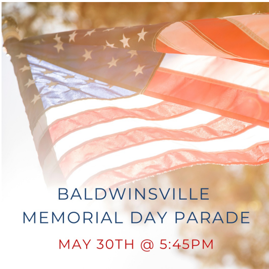
2024 Baldwinsville Memorial Day Parade

This spring, experts predict home design will follow fashion trends. The most major trend in both - the color brown. From textured walls, dark brown wood paneling, to couches, pillows, and accent pieces - brown will have it's moment in 2024.