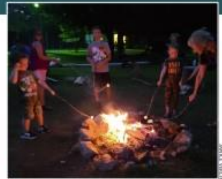
Sharing a campfire at Camp Lutherlyn.