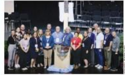
ELCIC members contributed in a variety of ways at the 13th Assembly of The Lutheran World Federation, in Krakow, Poland, September 2023.