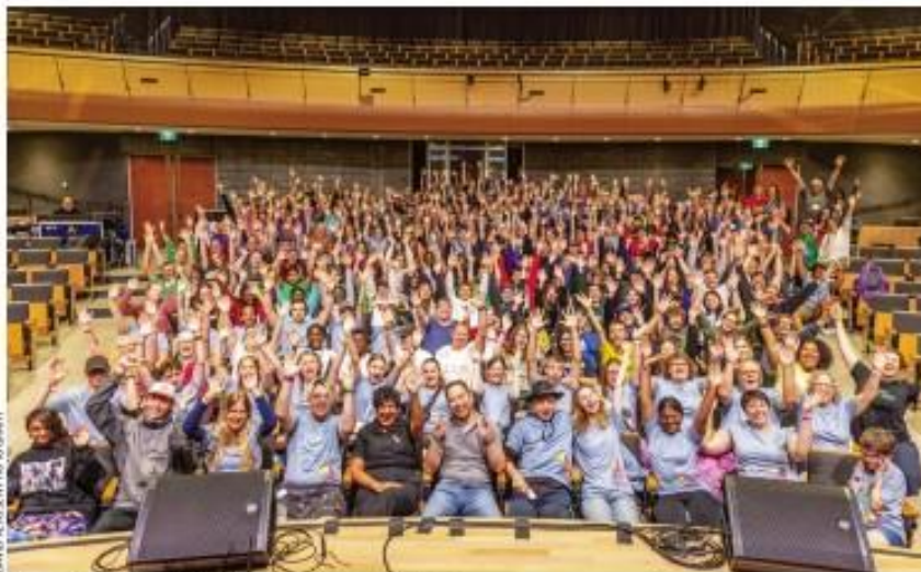
The entire CLAY gathering poses for a group shot.

BETWEEN THE LARGE GROUP GATHERINGS · PRAISE AND WORSHIP SESSIONS · REFLECTIVE GROUP EXPERIENCES AND PERSONAL PRAYER TIME · THE TRIP OUT TO WATERLOO, ONT. WAS FILLED WITH EXPERIENCES THAT WILL SURELY LAST A LIFETIME.