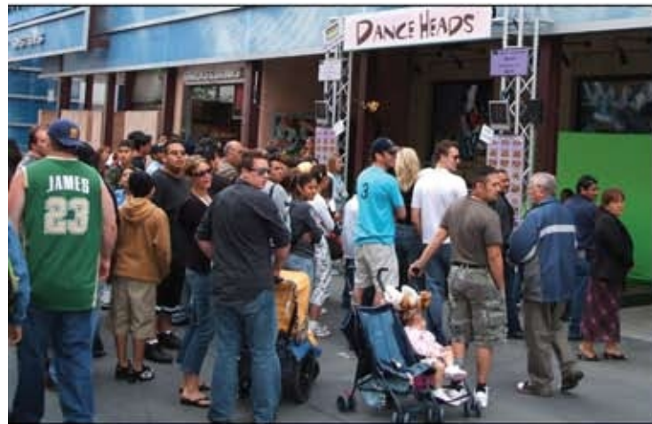
Universal Studios, Hollywood, CA