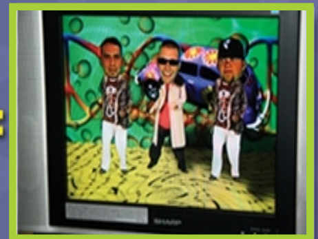
Take it home on a DVD