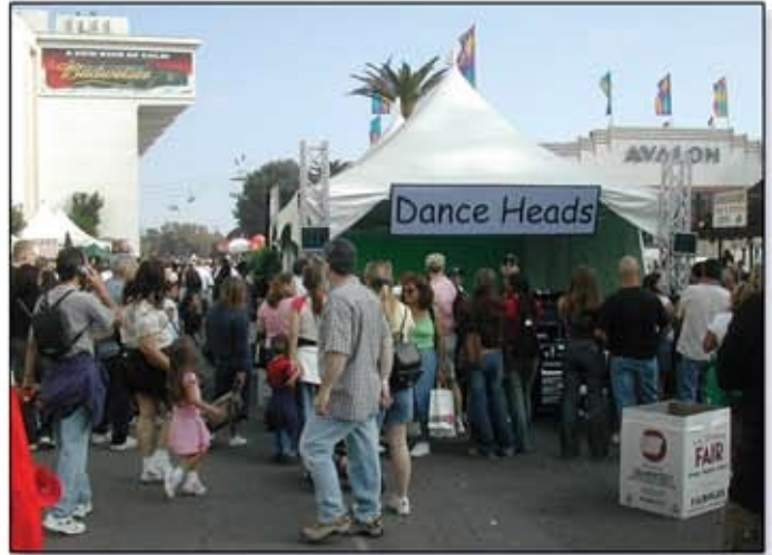
L.A. County Fair, CA