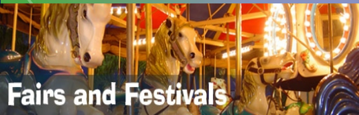
Fairs and Festivals