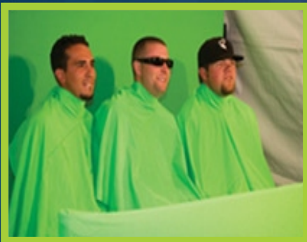
It's fun and easy to star in your own Dance Heads Music Video