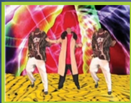
Just choose your favorite song, put on a smile, and bob your head to the beat! Each song can be done with 1, 2 or 3 people.