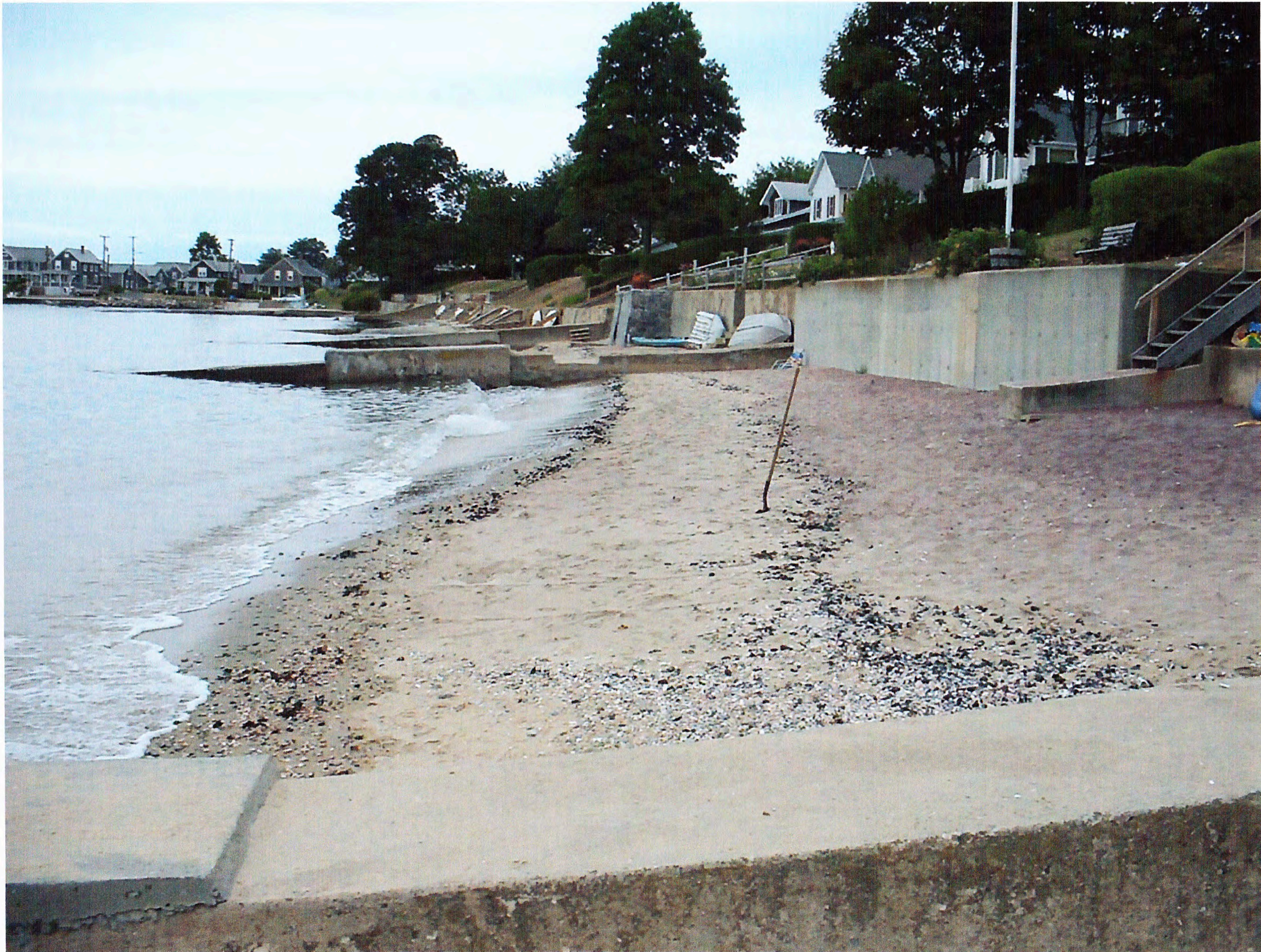
Figure 9 View West Along Segment 6 – High Tide Conditions - August 24,2002