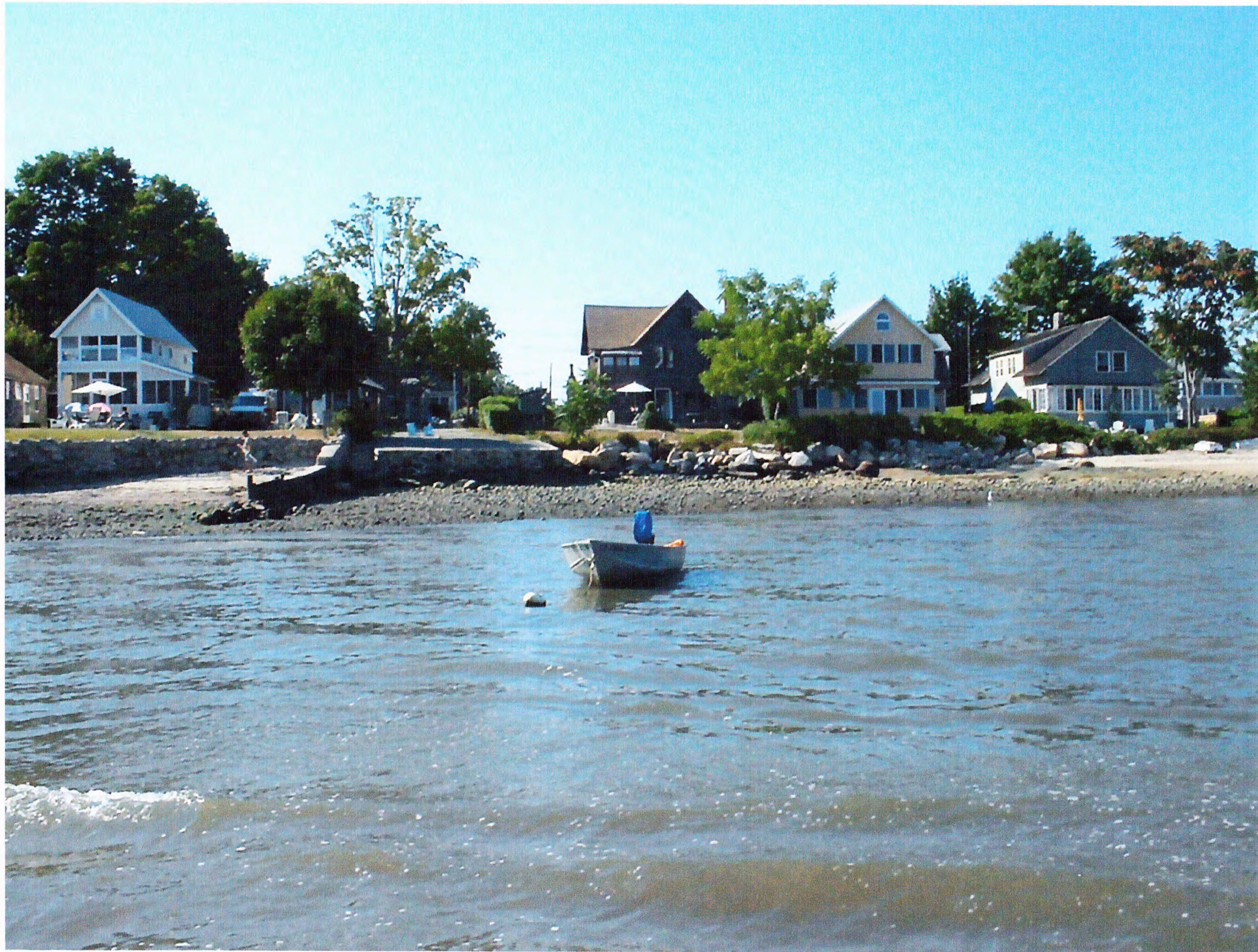
Figure 4 East End of Chapman Beach -- Proceeding to the West Note Sandy Pockets Along this Reach August 21, 2002