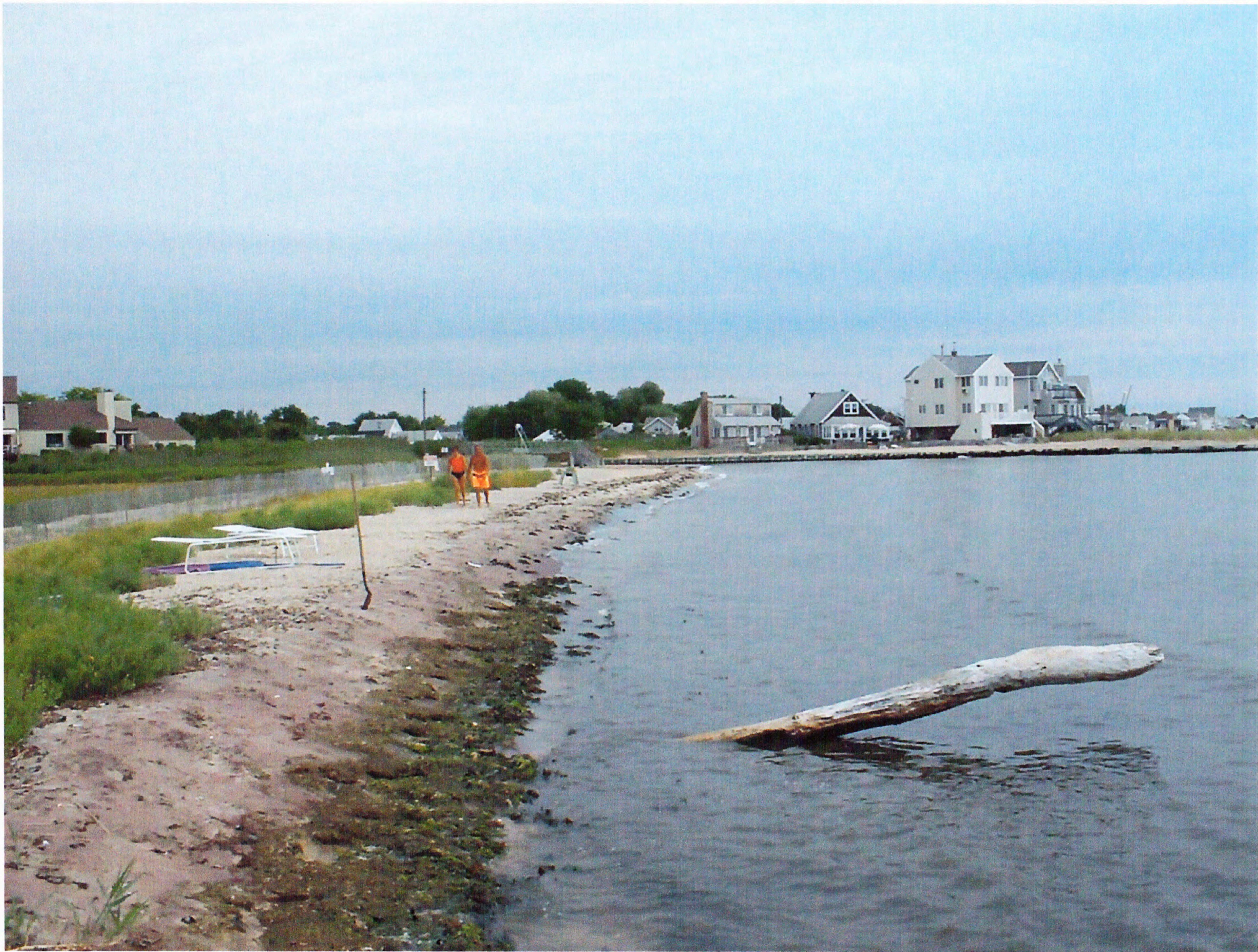
Figure 2 View East Along Barrier Beach Adjoining Cold Spring Brook High Water Conditions - August 24, 2002