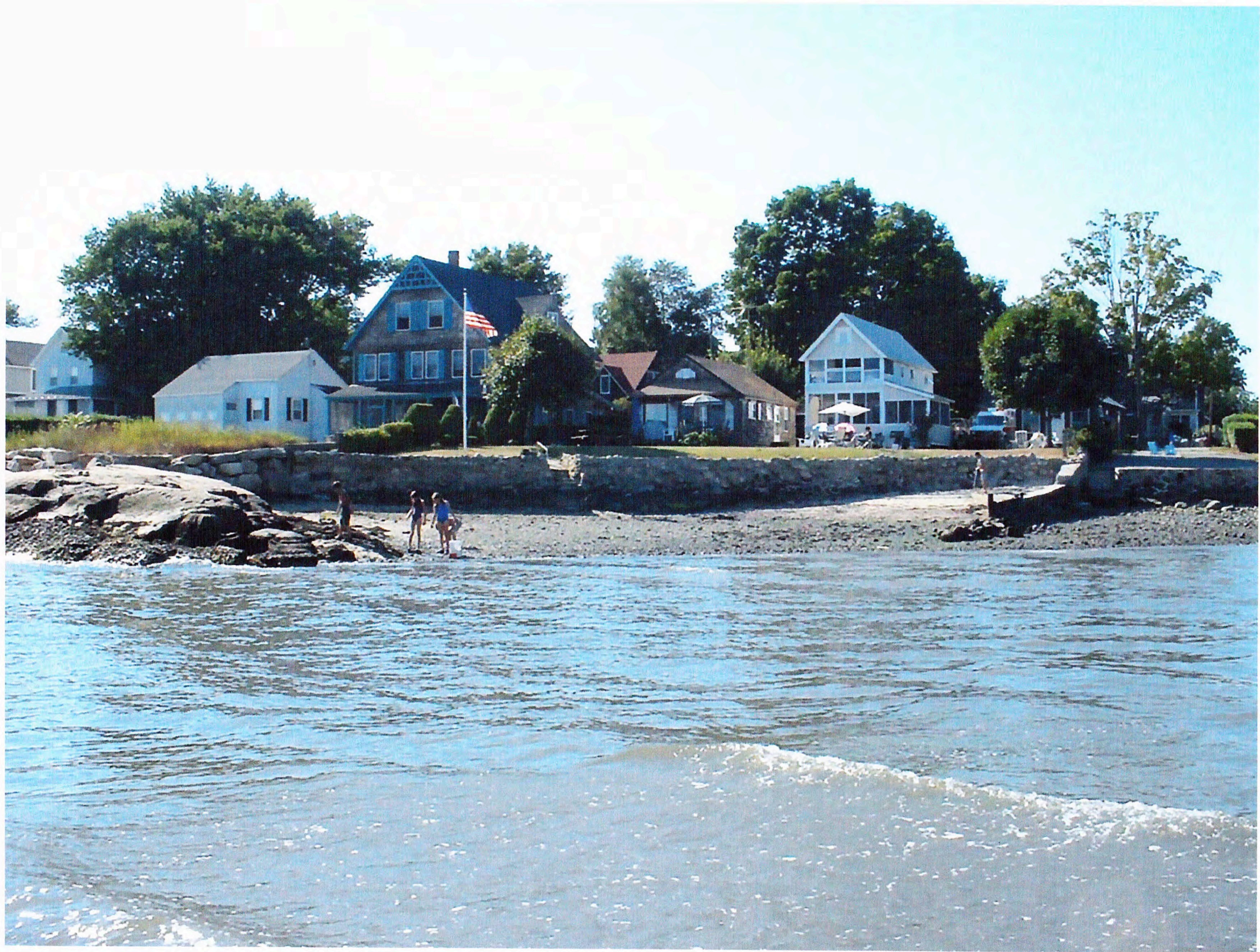
Figure 5 East End of Chapman Beach – Continue to Proceed West Pockets of Sandy Beachfront Again Evident – Note Outcrop - August 21,2002