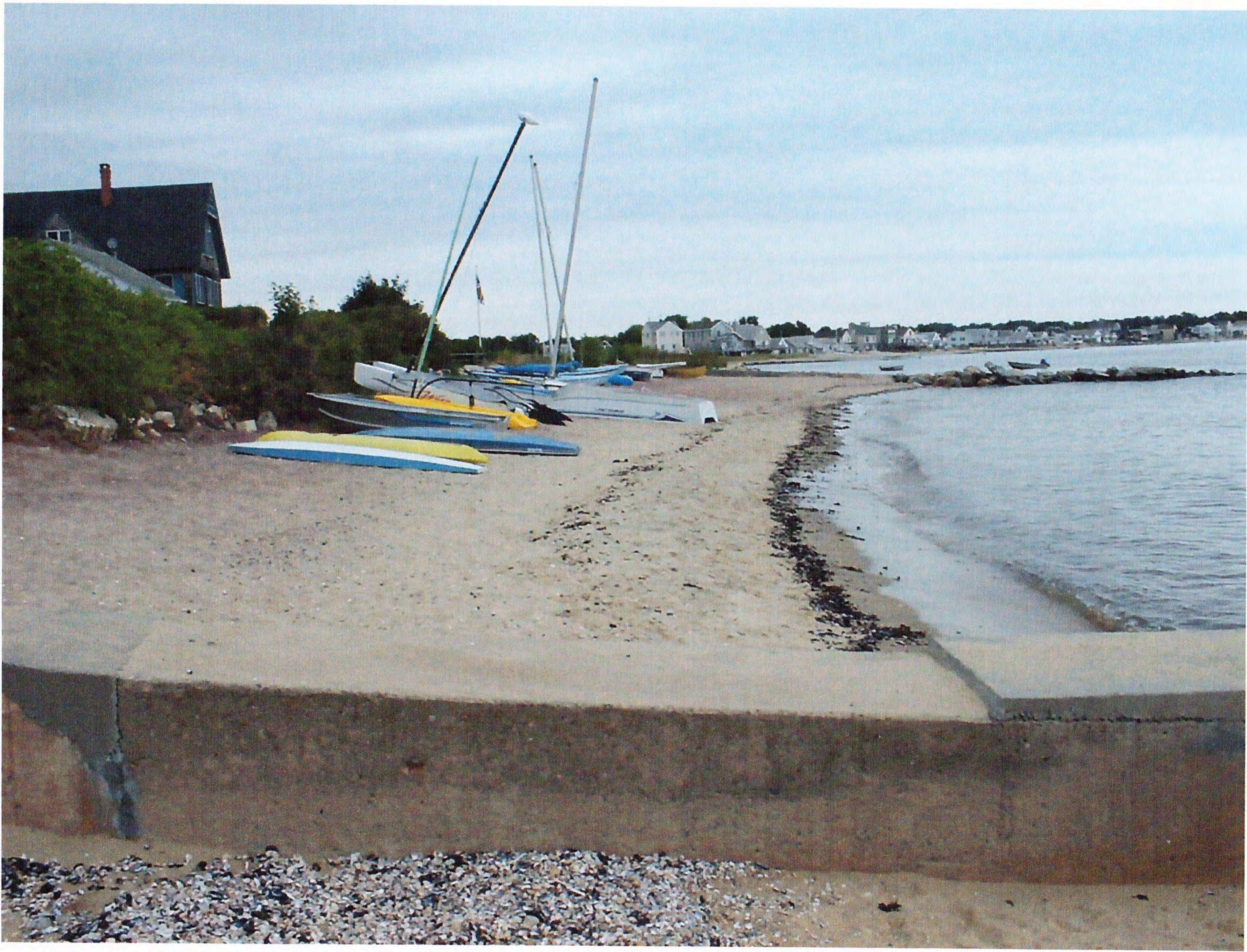
Figure 8 View East Along Segment 7 - High Water Conditions August 24,2002