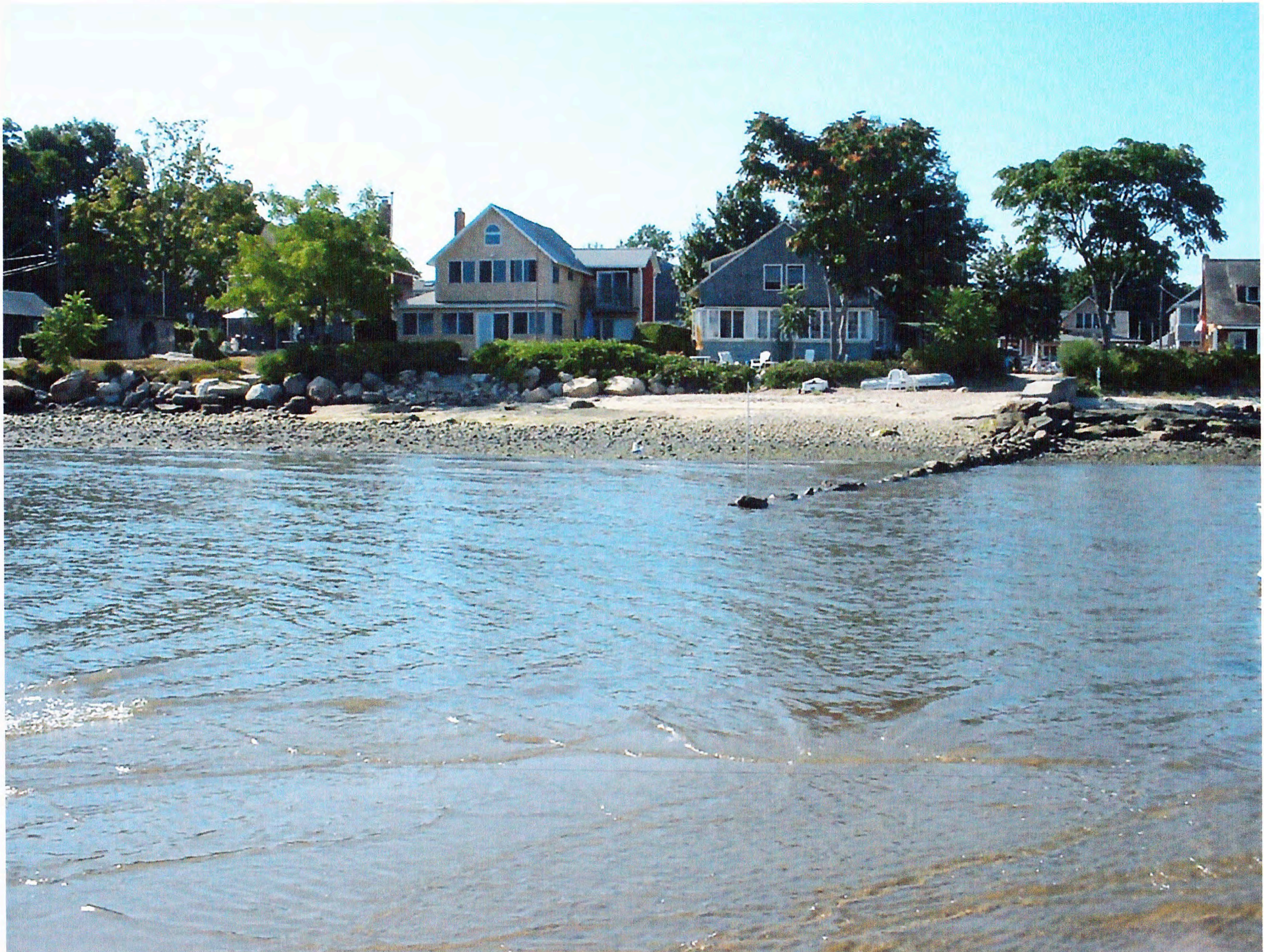
Figure 3 East End of Chapman Beach Adjoining Barrier Beach Area Near Chapman Drive and Hogan Drive August 21, 2002