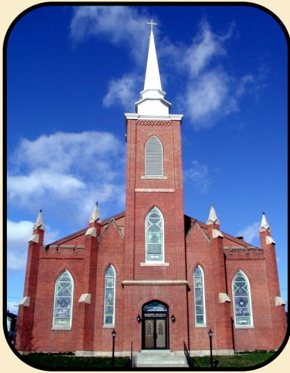
St. Mary 312 Clark St. Hollidaysburg, PA 16648