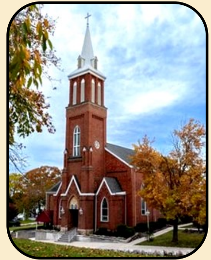
St. Michael The Archangel Parish 301 Spruce St. Hollidaysburg, PA 16648