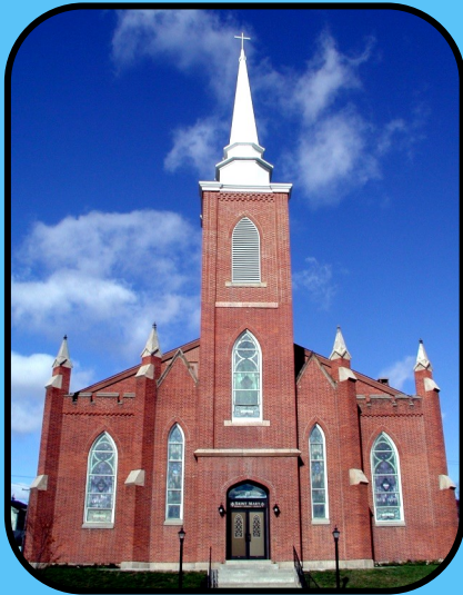
St. Mary 312 Clark St. Hollidaysburg, PA 16648