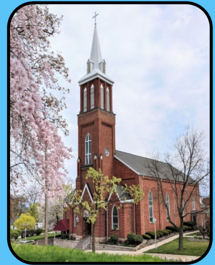
St. Michael The Archangel Parish 301 Spruce St. Hollidaysburg, PA 16648

Sunday of Divine Mercy Cycle B April 7, 2024