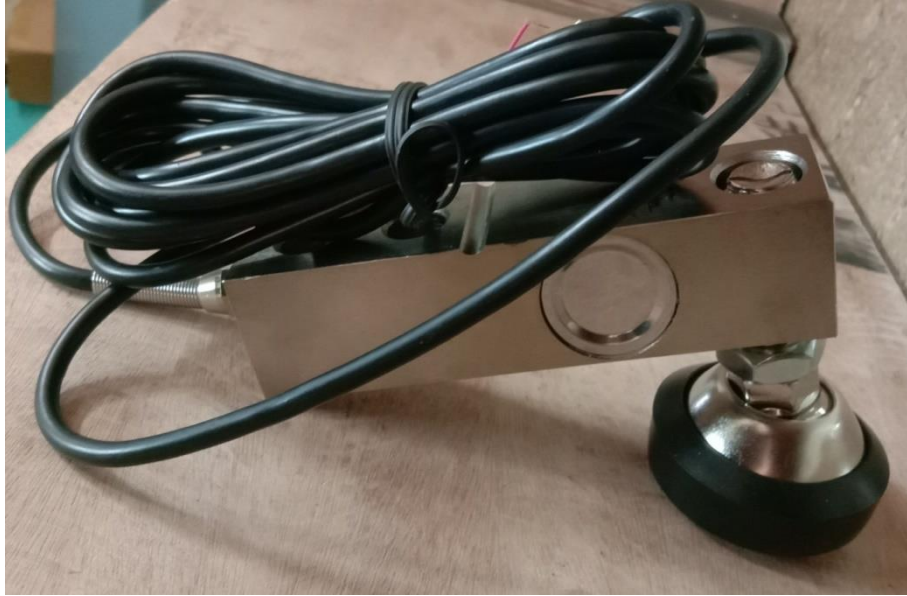
LOAD CELL (WITH LEG) (ST1022LLG)