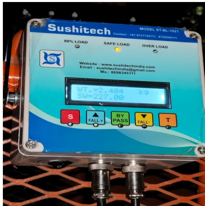
ASLI DISPLAY (ST-BL-1021)

ADD : SHREY EXOTICA, VASTRAL, AHMEDABAD 382418