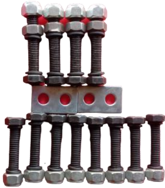
NUT BOLT (ST1022NBL)