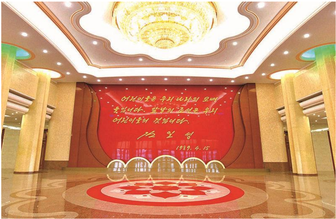
Front wall of the lobby inscribed with Kim Il Sung's handwriting which reads: "The children are treasures of the country and future Korea is theirs. Kim Il Sung. April 15, 1989"