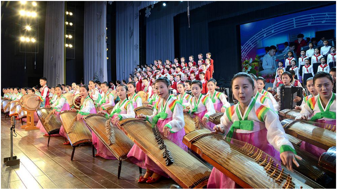
Extracurricular activities of schoolchildren at the Mangyongdae Schoolchildren's Palace