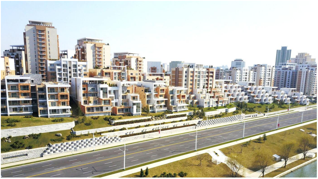
Part of the newly-built Pothong Riverside Terraced Houses District in Pyongyang