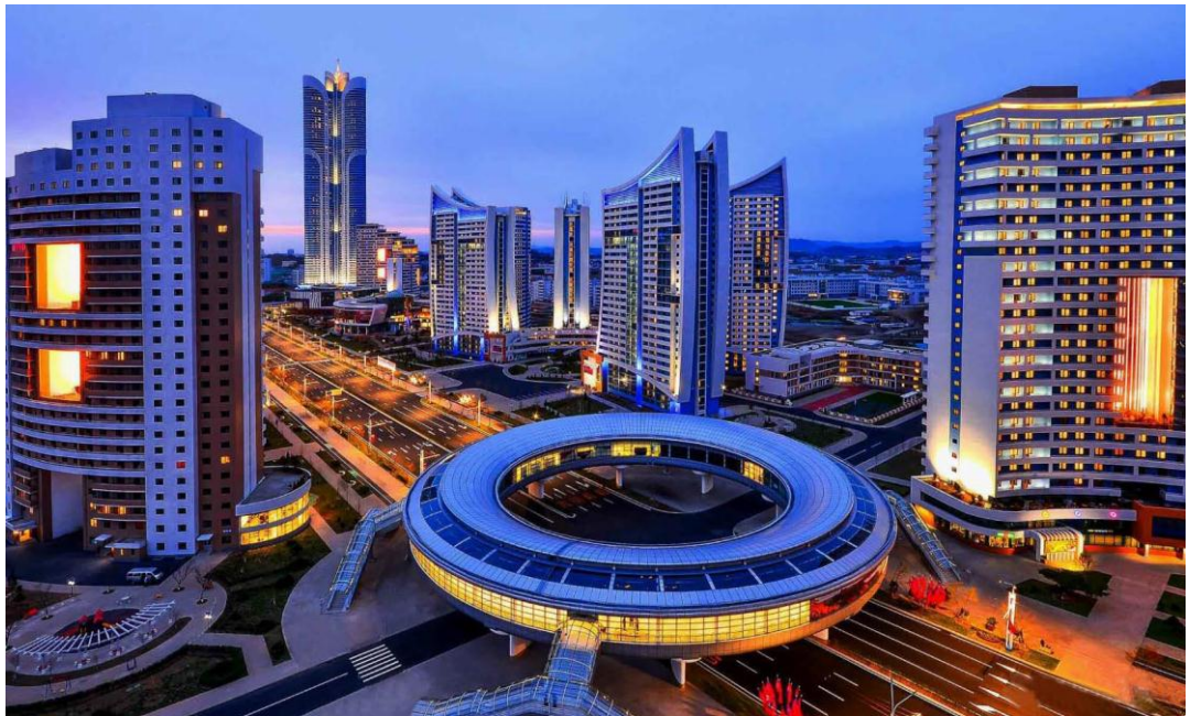
Night view of Songhwa Street inaugurated in April this year