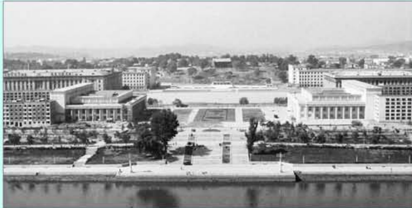
Kim Il Sung Square in the mid-1960s