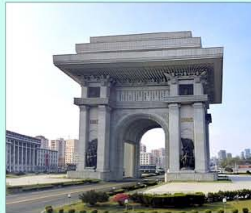
Arch of Triumph