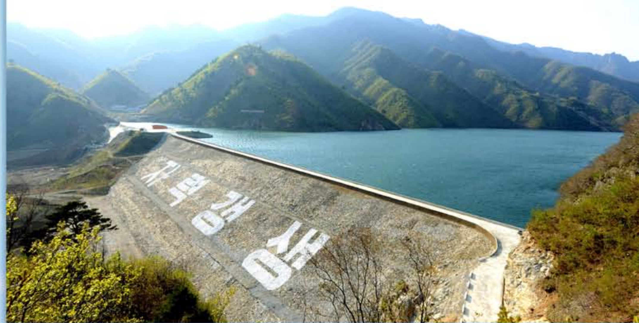
Dam of the Wonsan Army-People Power Station built by the own efforts of the provincial people

K angwon Province in the middle eastern part of Korea consists mostly of mountainous regions and has unfavourable, changeable climatic conditions and fragile industrial foundations.