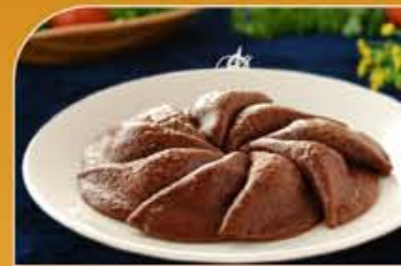
Glutinous Indian millet pancake