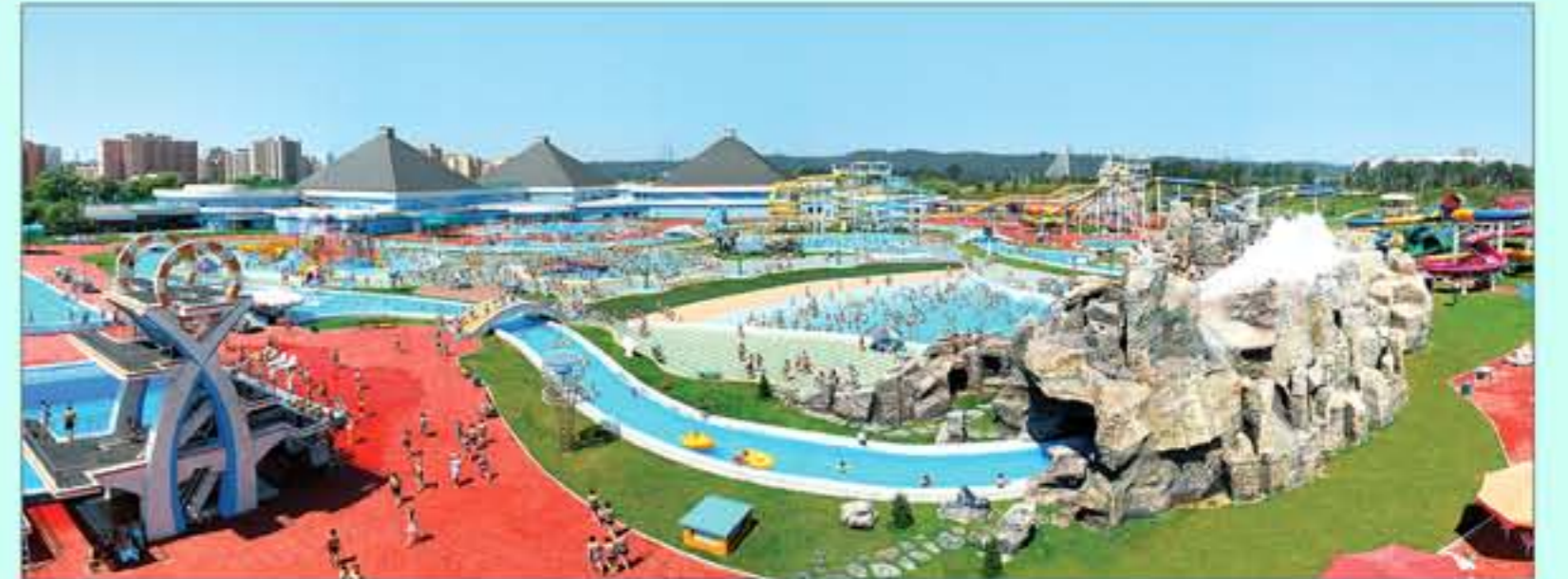
Munsu Water Park