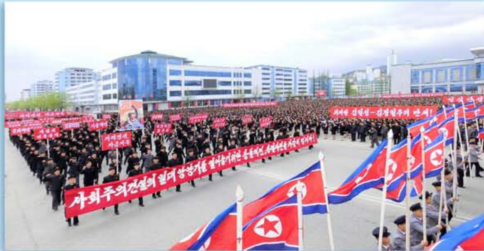
People of Kangwon Province demonstrating their determination to give full play to the spirit of self-reliance and self-sufficiency and take the lead in making fresh breakthroughs in socialist construction as befits the creators of the spirit of Kangwon Province (April 2018)