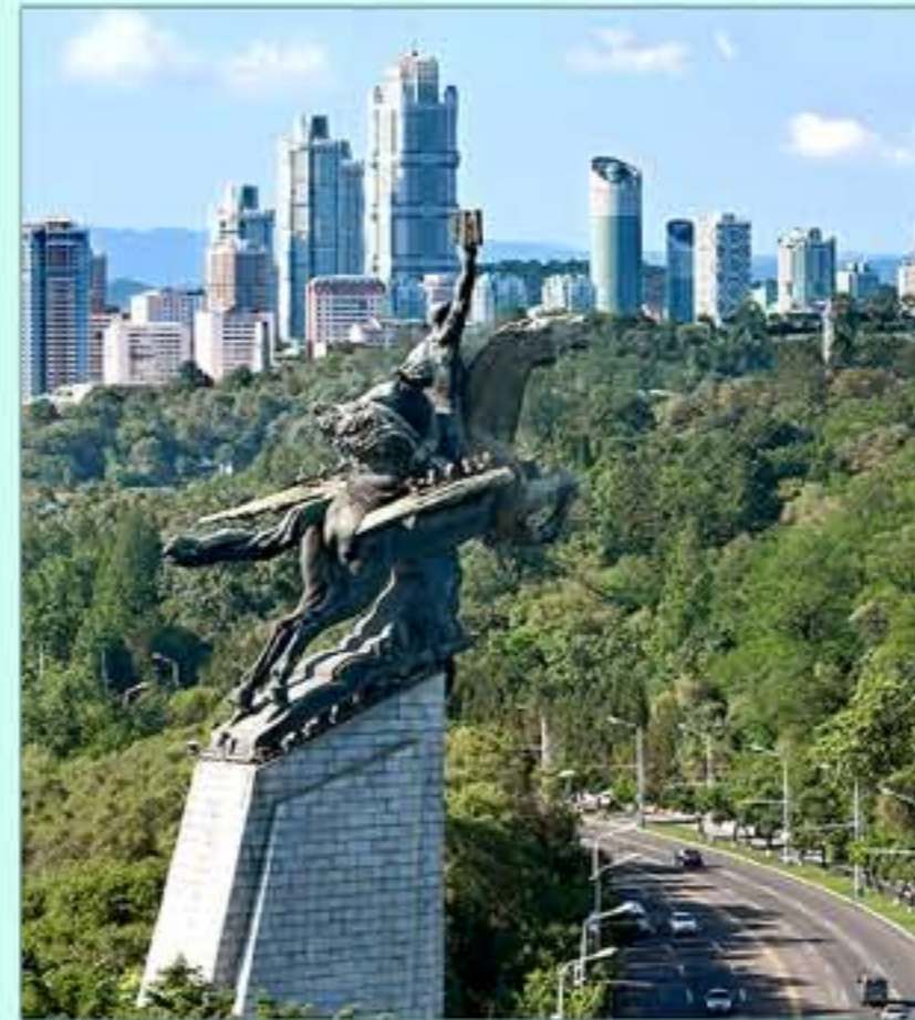
Statue of Chollima