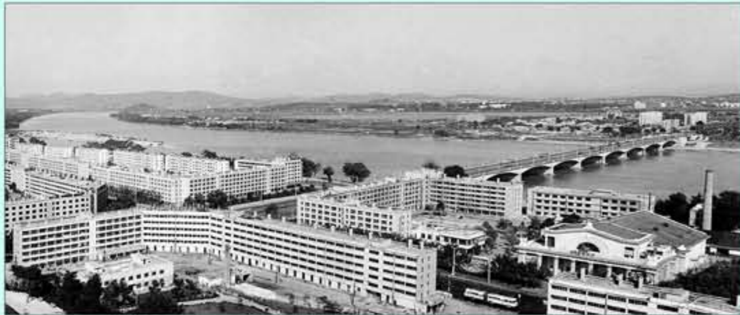
Kyongsang-dong in the mid-1960s