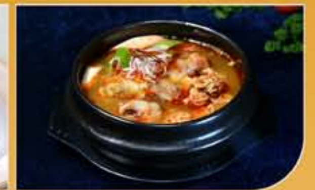
Spicy Pollack soup

The area of Hamgyong Province in Korea covers the present-day North and South Hamgyong and Ryanggang provinces, and some parts of Kangwon Province.