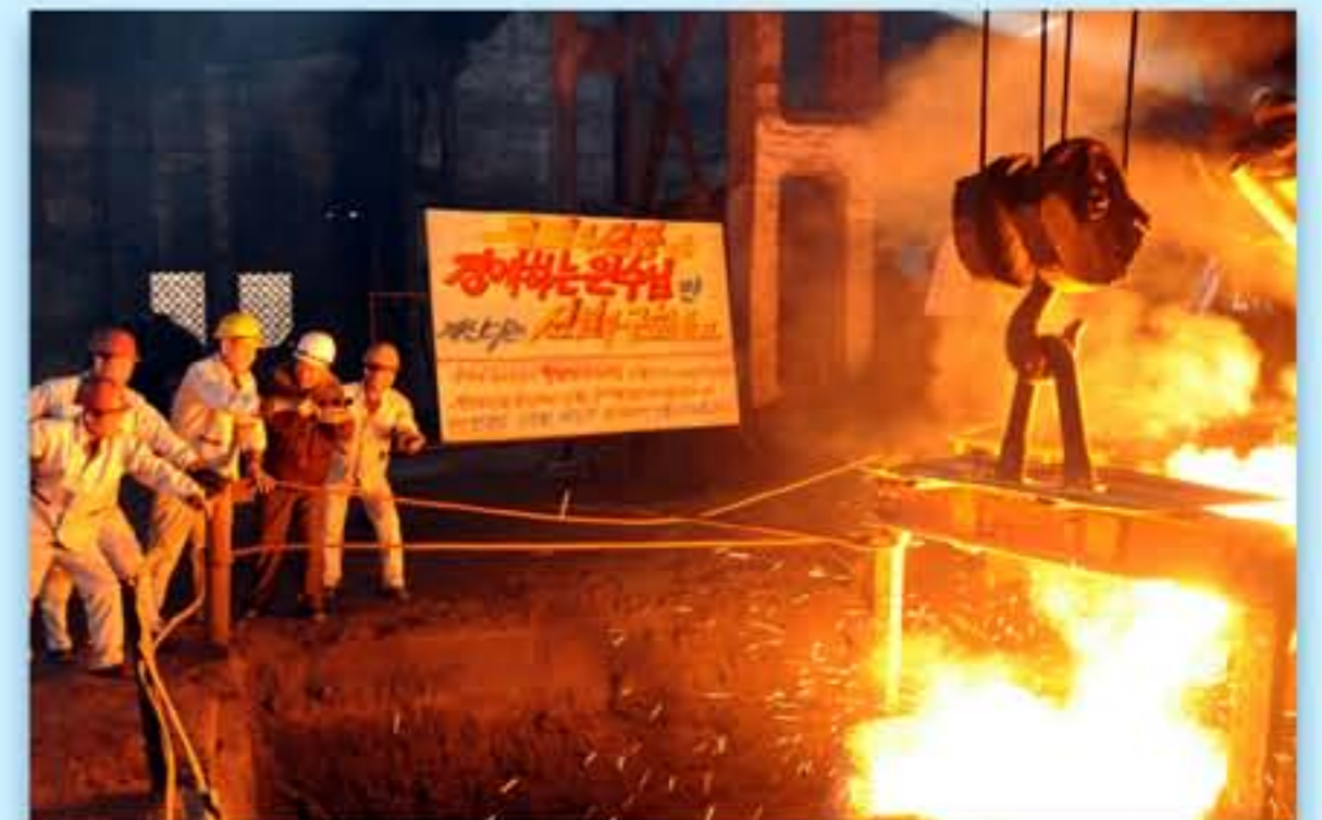
Munchon Steel Plant