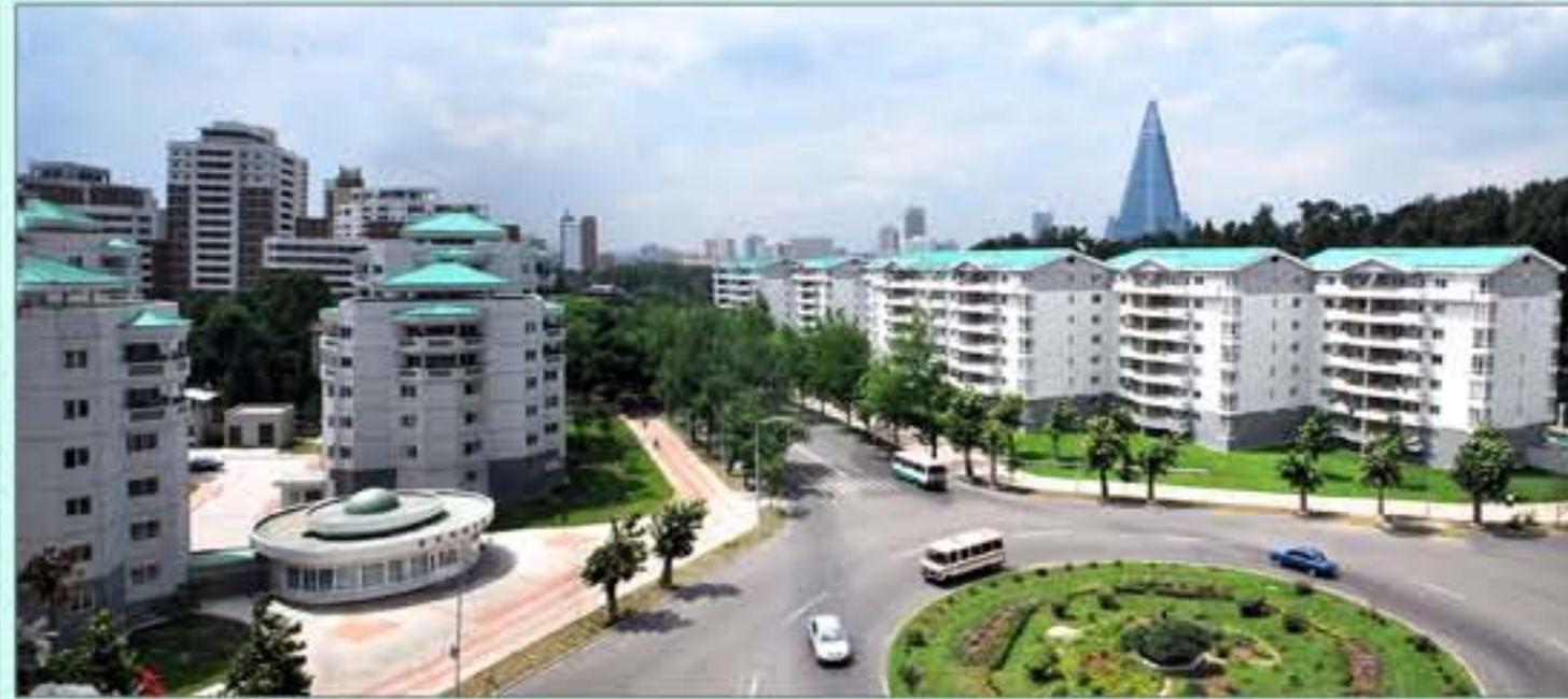
Mansudae Street erected in 2009