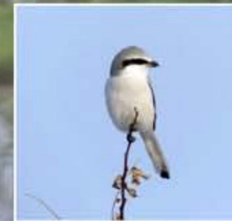
Chinese Grey Shrike