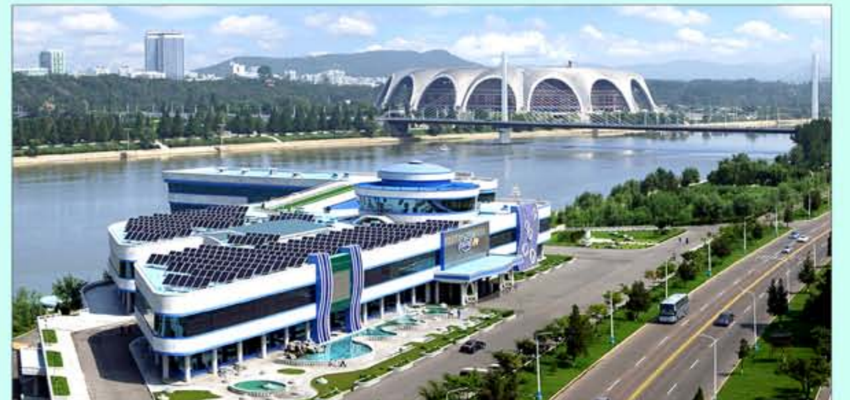
May Day Stadium and other sporting and cultural establishments erected on the banks of the Taedong River