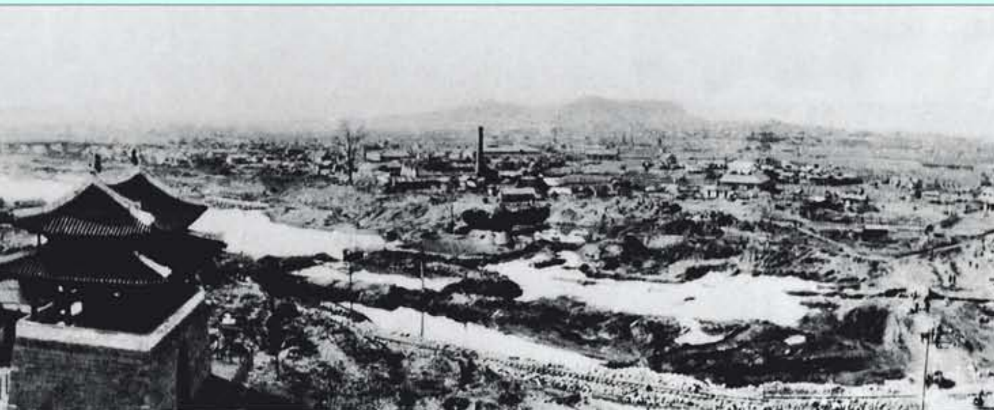
Pothongmun area after the war