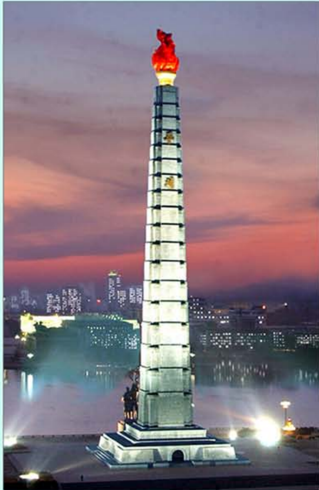
Tower of the Juche Idea