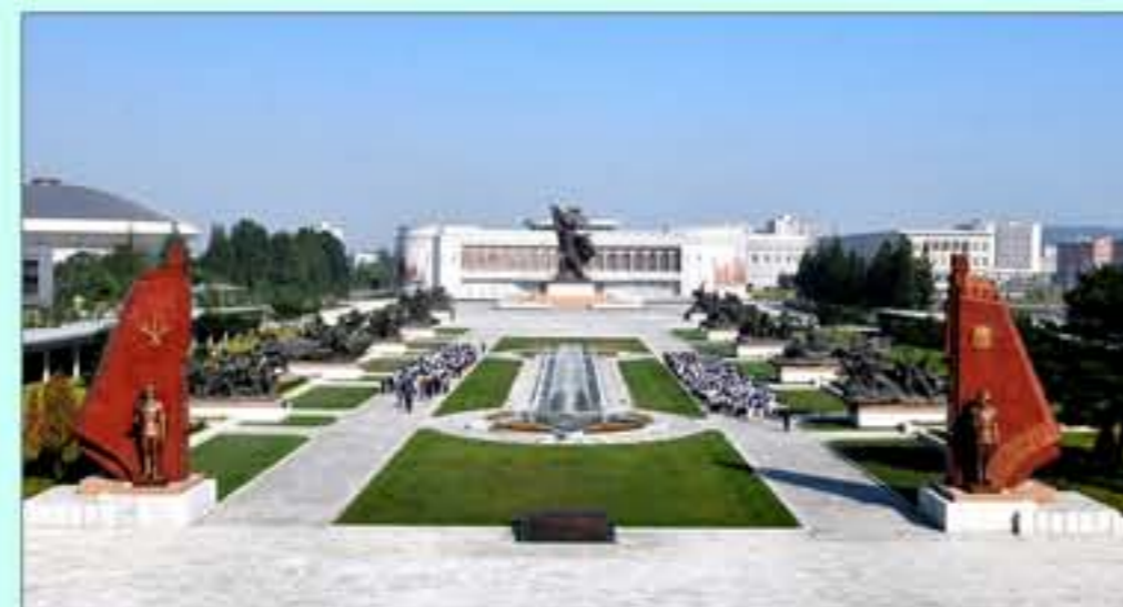
Victorious Fatherland Liberation War Museum