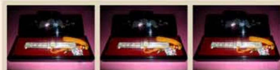
Ornamental silver daggers for the triplets (June 2013)