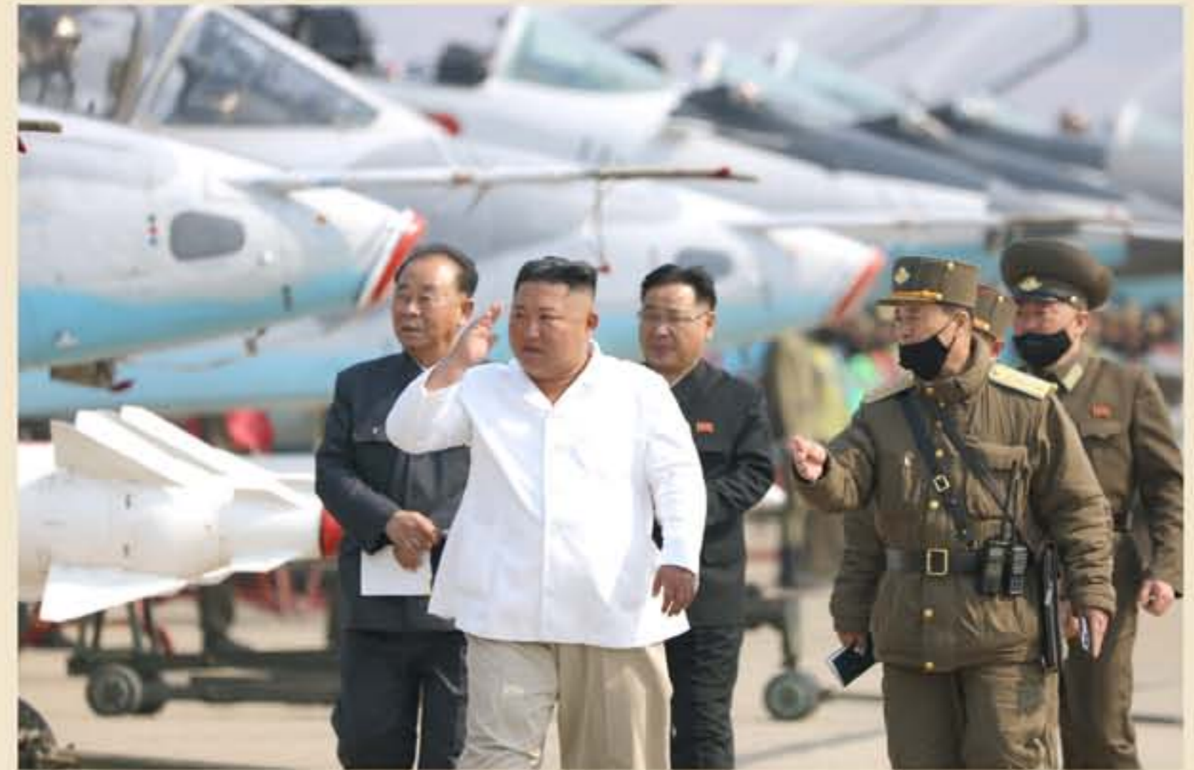
Kim Jong Un inspecting a pursuit assault plane regiment under the Air and Anti-Aircraft Division in the western area in April 2020