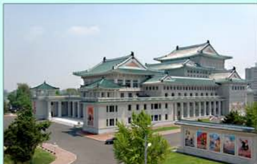
Pyongyang Grand Theatre