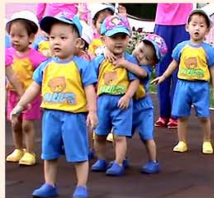
At the Pyongyang Baby Home (2015)