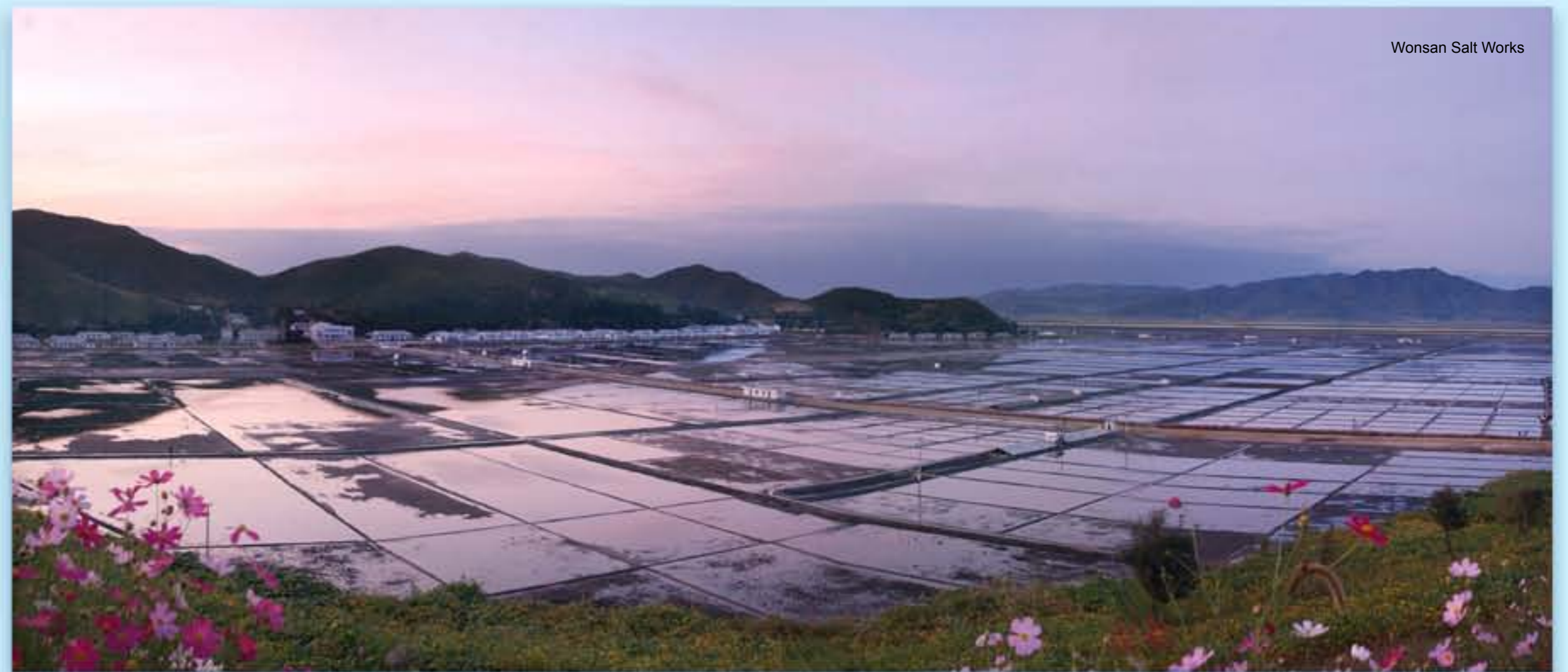
Wonsan Salt Works