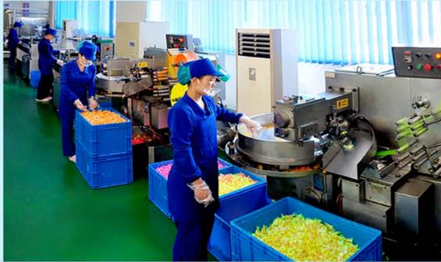
Songdown General Foodstuff Factory relies on locally available materials in production