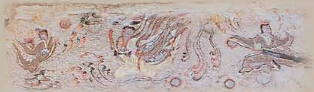
Korean Folk Dance