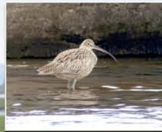
Far Eastern Curlew(EU)