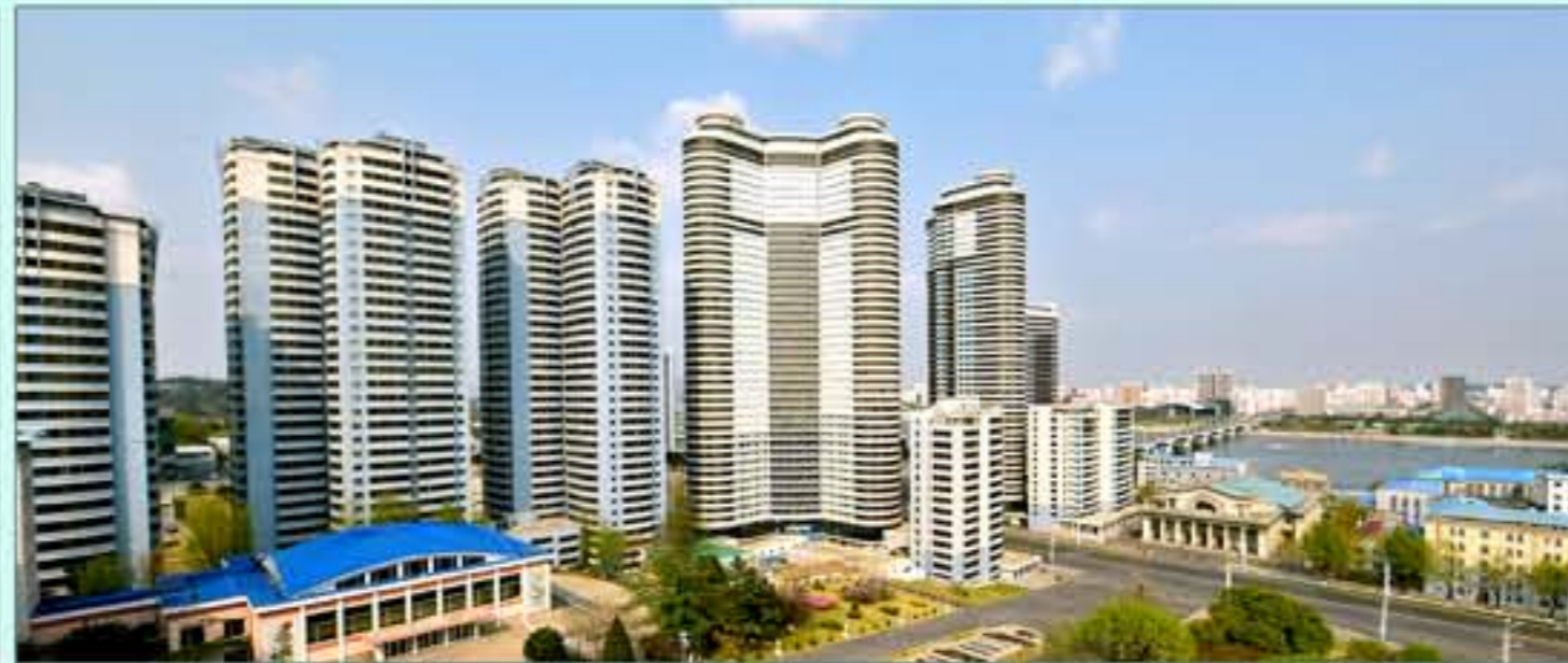
Changjon Street built in 2012