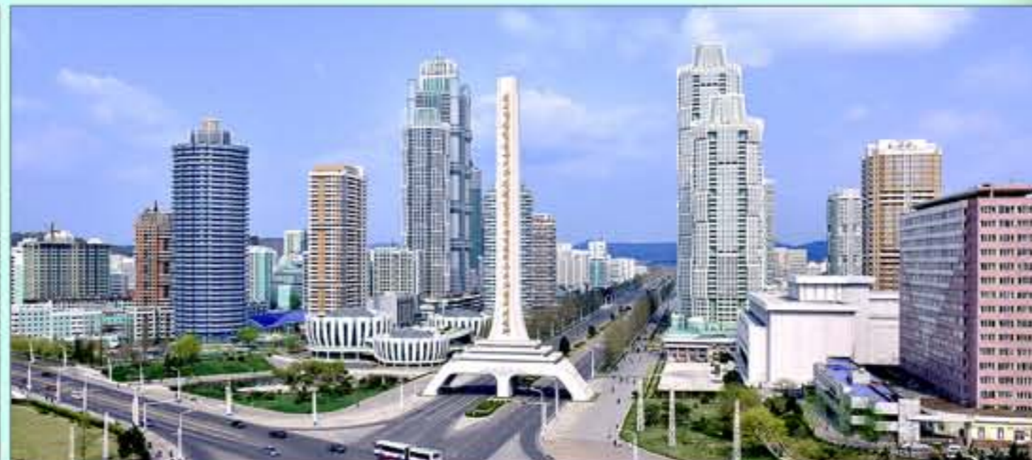
Ryomyong Street built in 2017