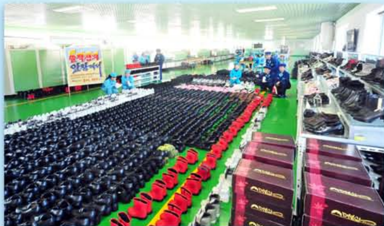
Wonsan Leather Shoes Factory

Article: Kim Son Gyong