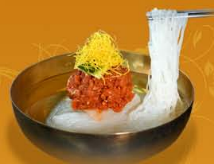
Noodles garnished with raw fish slices