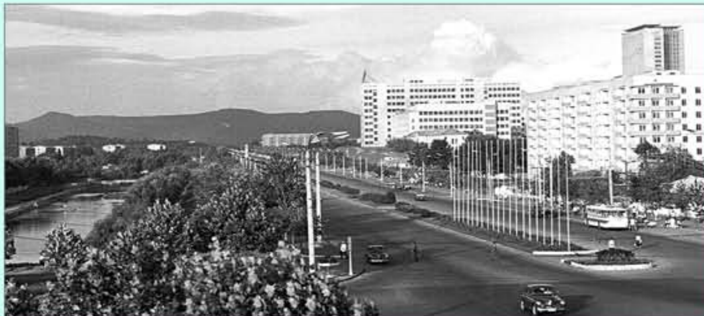
Kumsong Street in the early 1970s