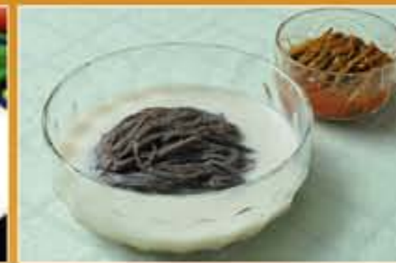
Frozen potato noodles and yongchae kimchi