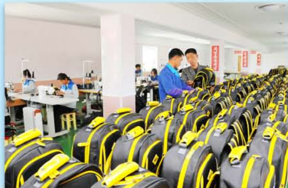
Wonsan Disabled Soldiers' Bag Factory