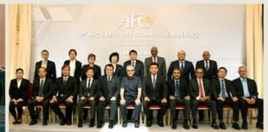
At the Executive Committee Meeting of the AFC held in Uzbekistan in September 2018