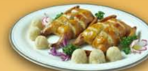
Steamed broiler chicken

Typical dishes are potato starch noodles, pancake made of glutinous Indian millet, tangogi soup, hot Pollack soup, yongchae kimchi and fermented spicy flatfish.