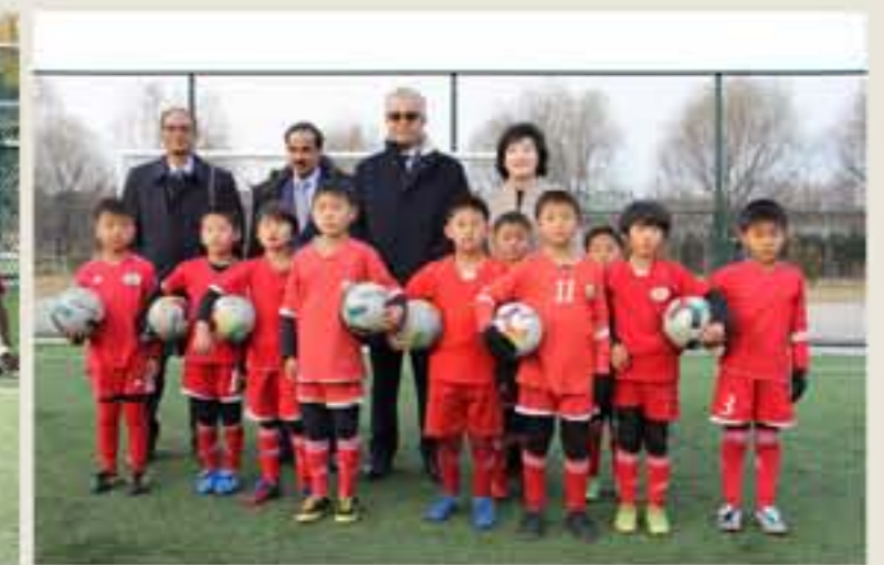
At the Pyongyang International Football School together with the AFC members