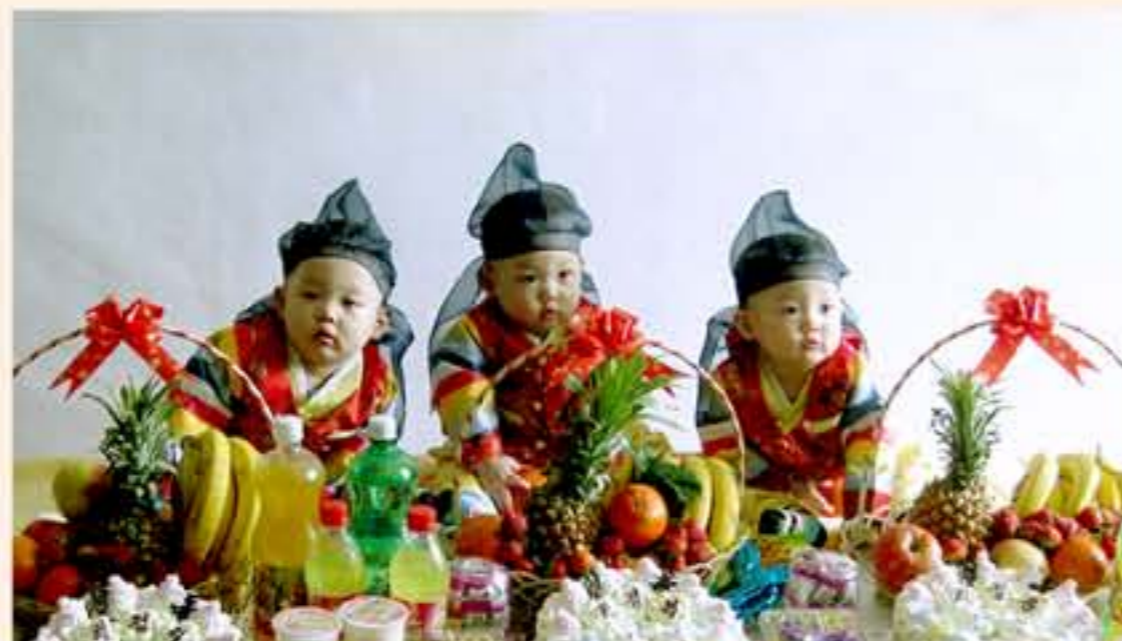
On the first birth anniversary (April 2014)