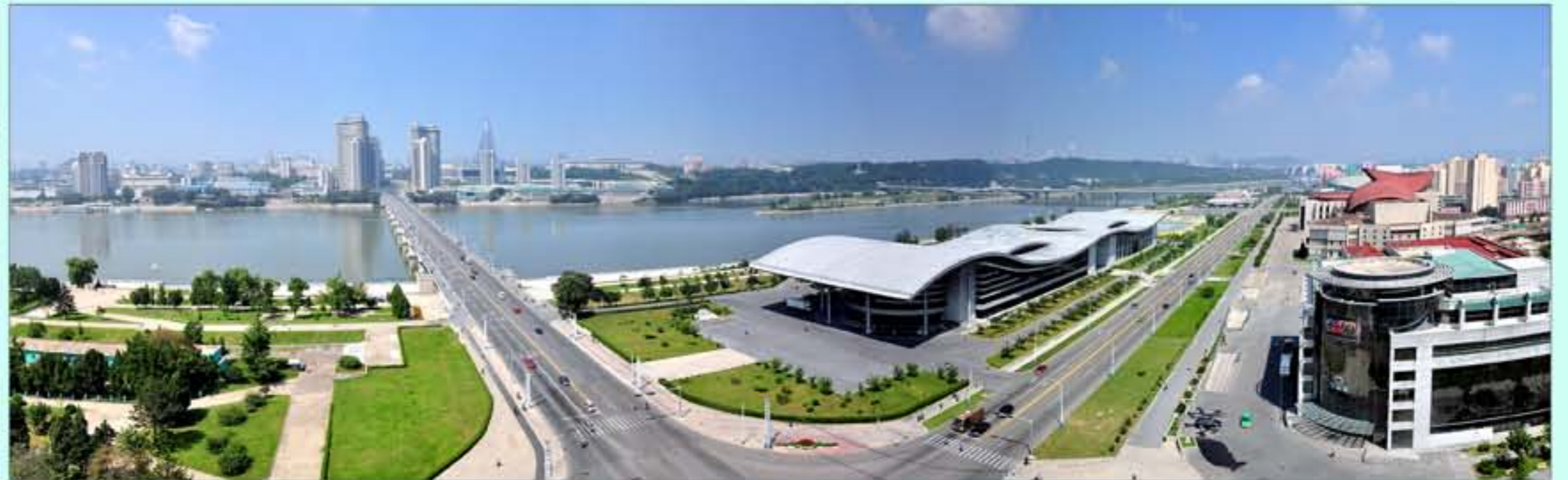
The areas along the Taedong and Pothong rivers in Pyongyang have been facelifted