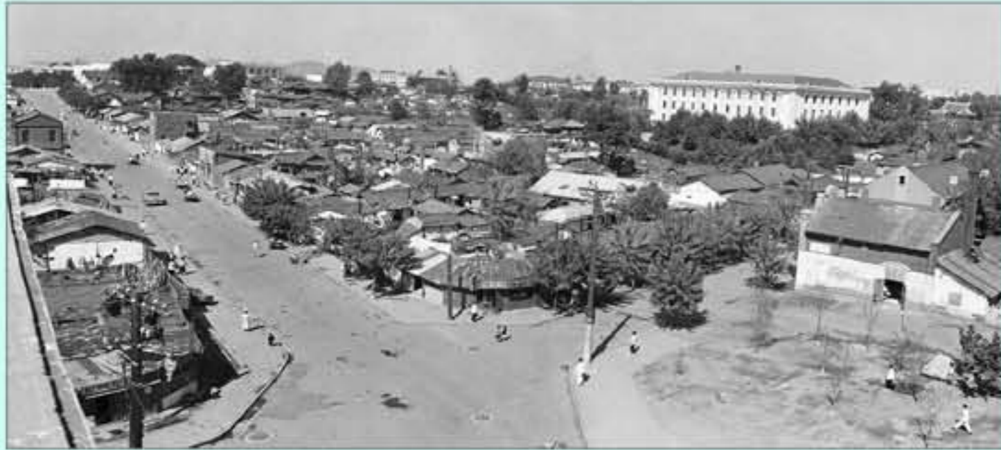
Somun-dong in the early 1960s