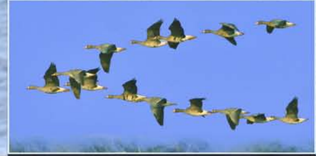
Lesser White-fronted Goose