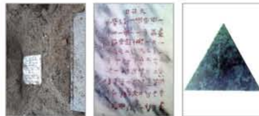
Stone slab inscribed with "Chonbugyong" and a triangular jade slab symbolic of Tangun in the religion

Recently a slab of marble and a regular triangular slab of gemstone inscribed with letters were unearthed on top of Janggun Peak in Mt Paektu.