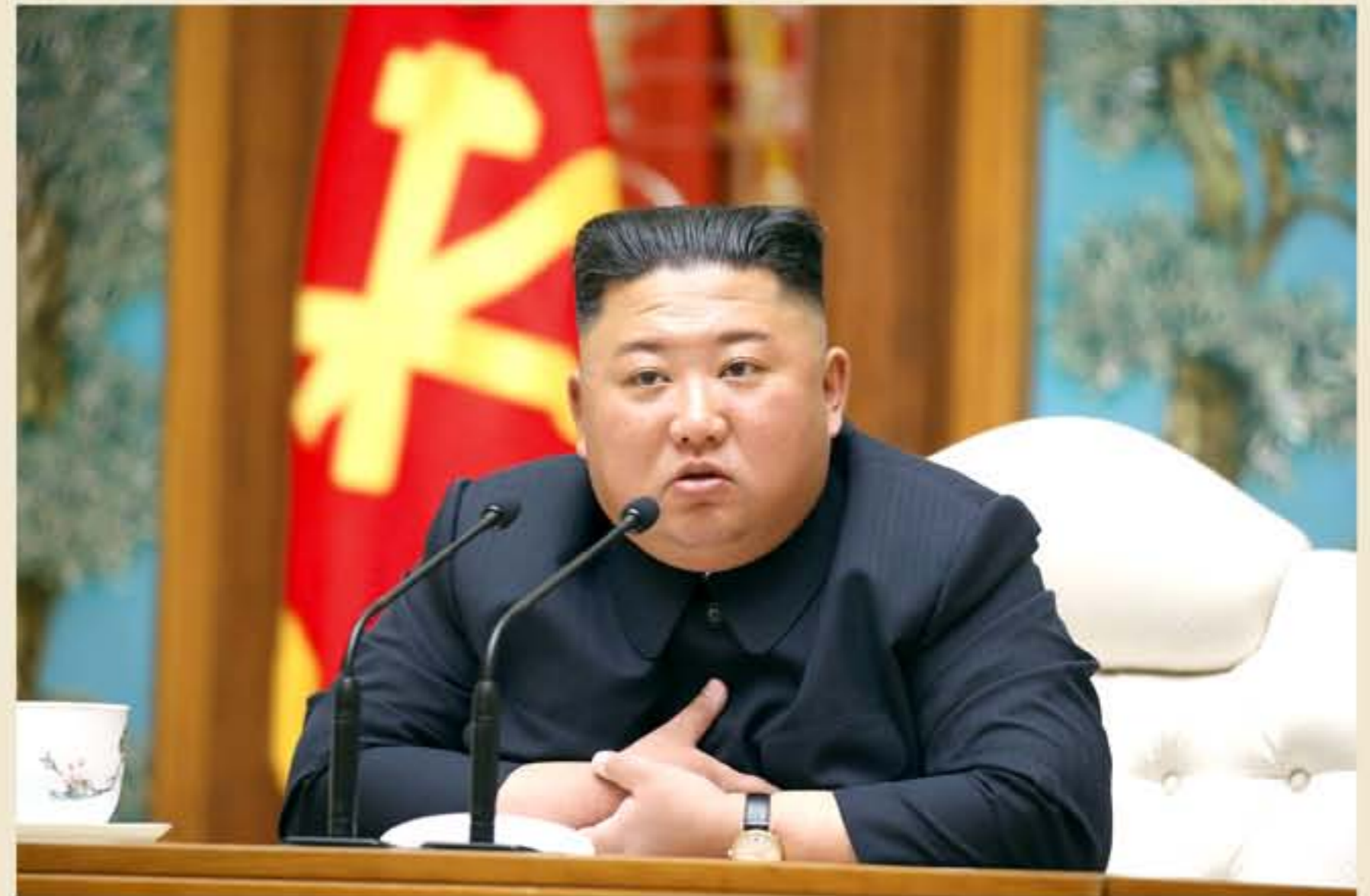
Kim Jong Un attending the meeting in April 2020

Chairman Kim Jong Un said that Party organizations at all levels, cadres and Party members should launch a revolutionary campaign to thoroughly carry out the policies of the Party Central Committee with greater consciousness and strenuous efforts as the meeting of the Political Bureau adopted the joint resolution and put forward new and important policies and tasks.