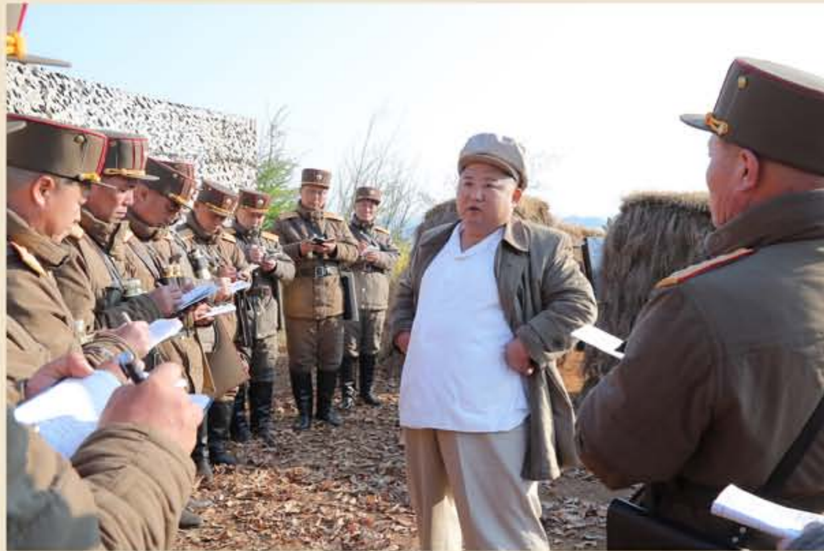
Kim Jong Un guiding the firing drill of mortar sub-units of the corps of the Korean People's Army in April 2020