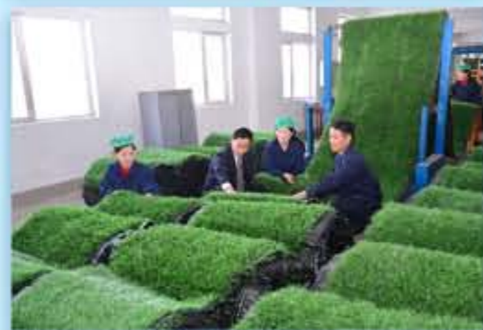
Wonsan City Corn Processing Factory, Wonsan Kimchi Factory and other local industry factories are highly conducive to improving the living standard of the provincial people