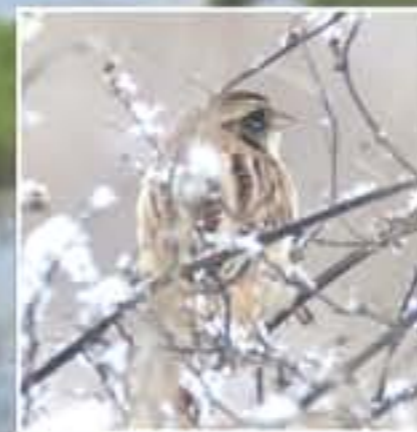
Common reed Bunting(NT)