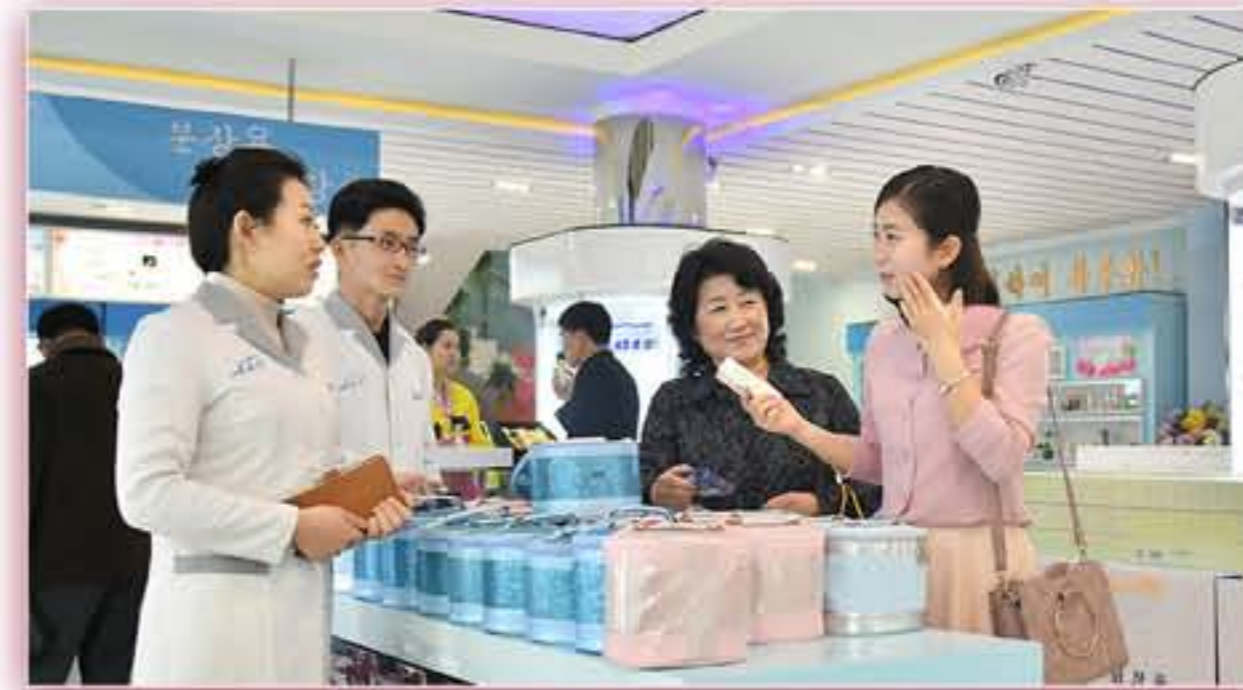
Unhasu cosmetics enjoy popularity among people

Unhasu cosmetics of the Pyongyang Cosmetics Factory are enjoying popularity among users.