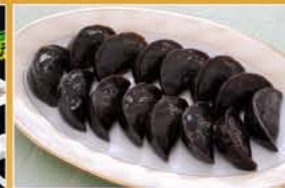
Frozen potato cake