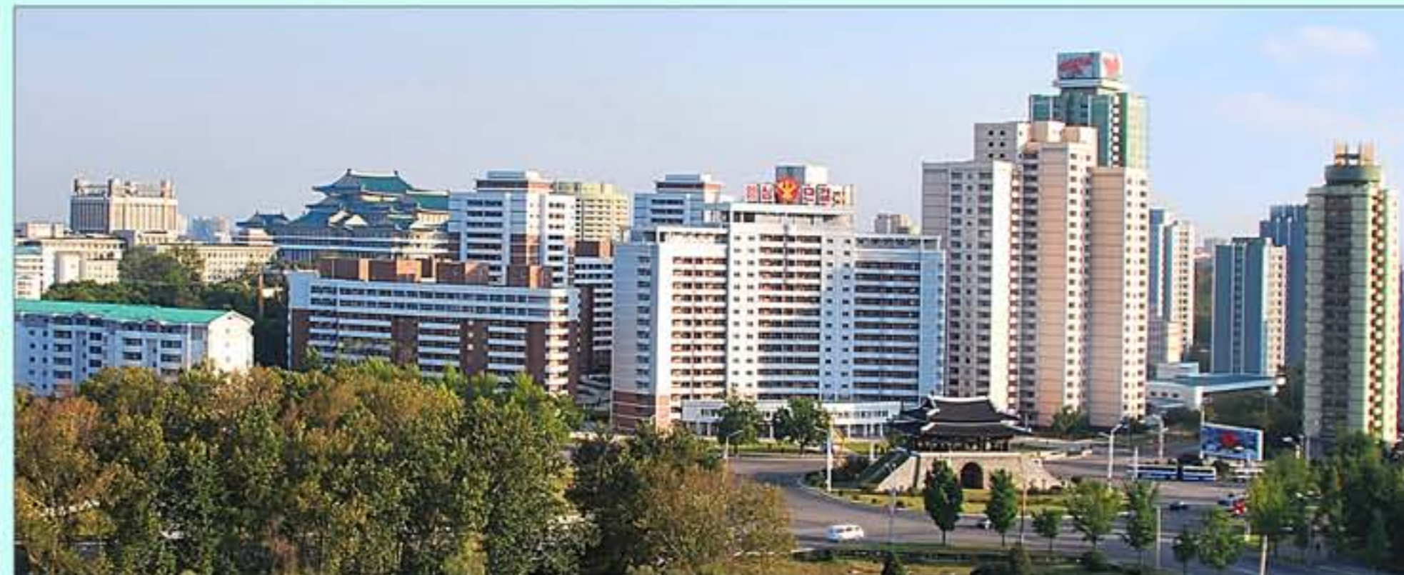
Pothongmun area at present