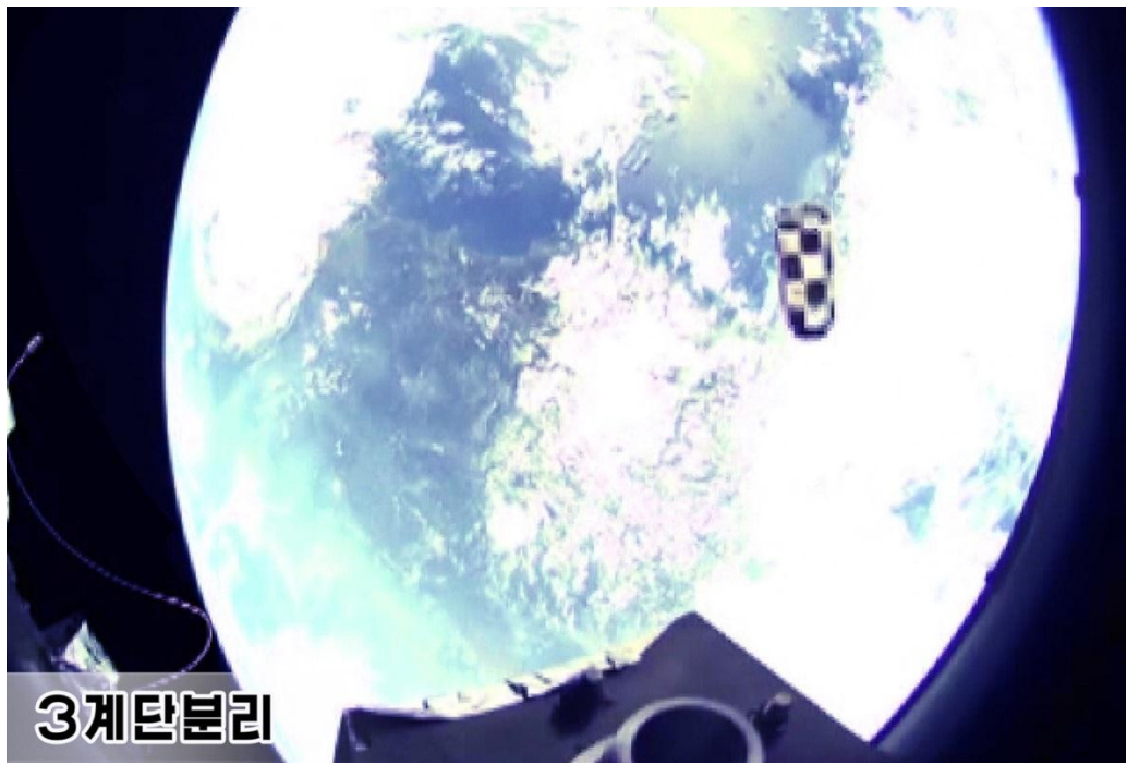
The third-stage separation of Hwasongpho-18