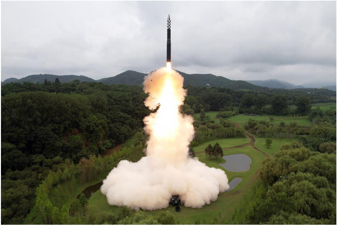
New-type ICBM Hwasongpho-18 soars into the sky demonstrating the practical power of the DPRK's strategic forces.