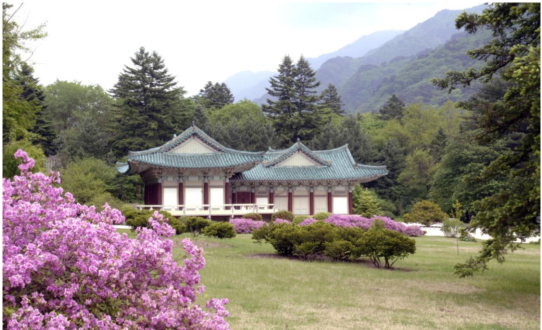
The house in Mt Myohyang, where the 80 000 Blocks and the Complete Collection of Buddhist Scriptures printed with the blocks are preserved