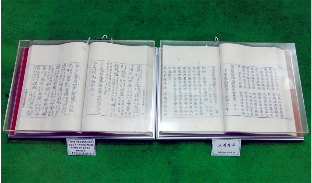
Part of the Complete Collection of Buddhist Scriptures preserved in the Pohyon Temple in Mt Myohyang