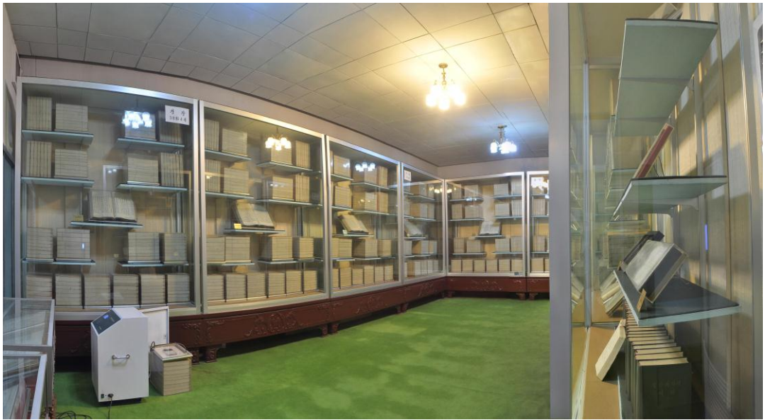
Some of the rooms preserving the Complete Collection of Buddhist Scriptures