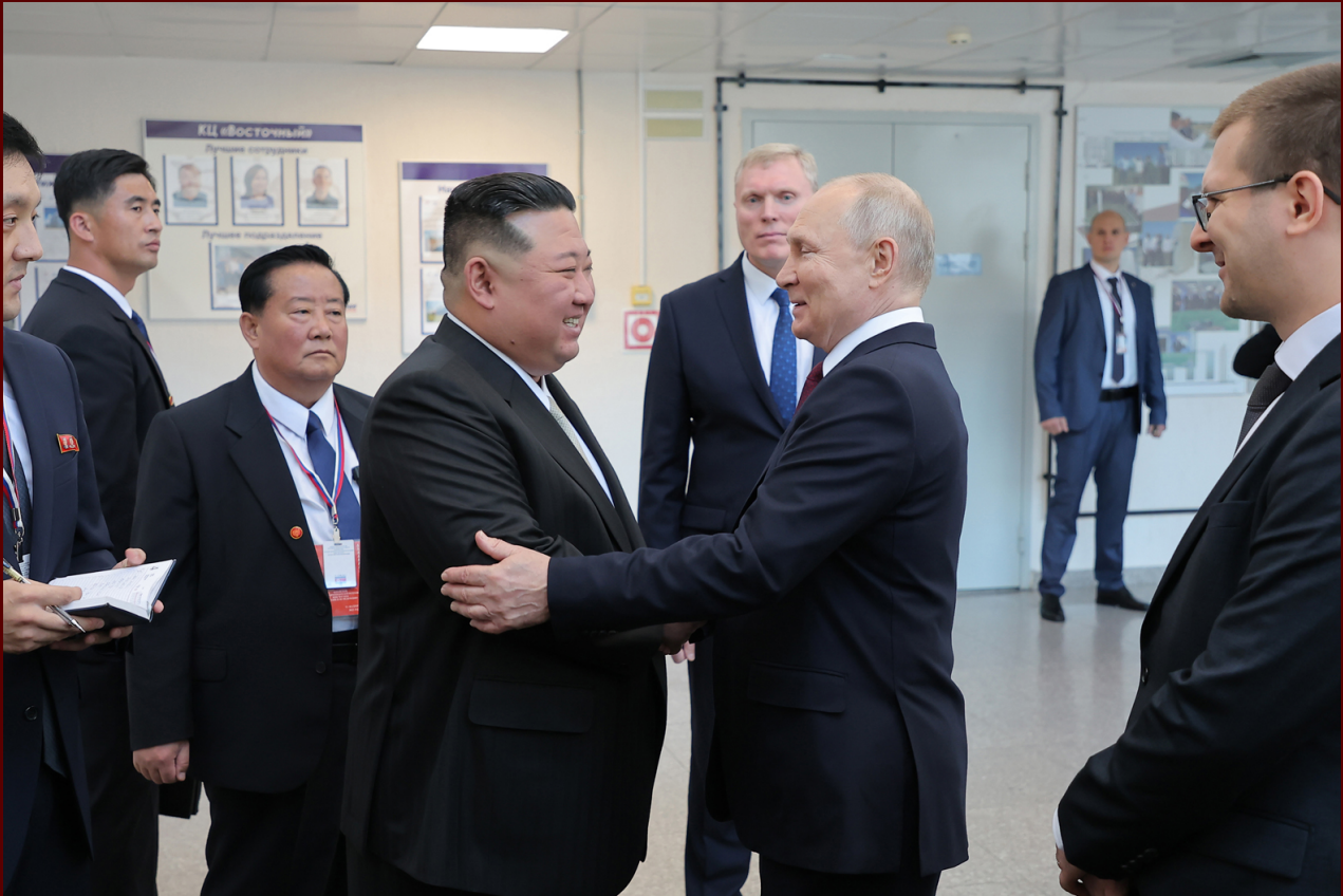
Kim Jong Un meets and exchanges friendly greetings with Putin