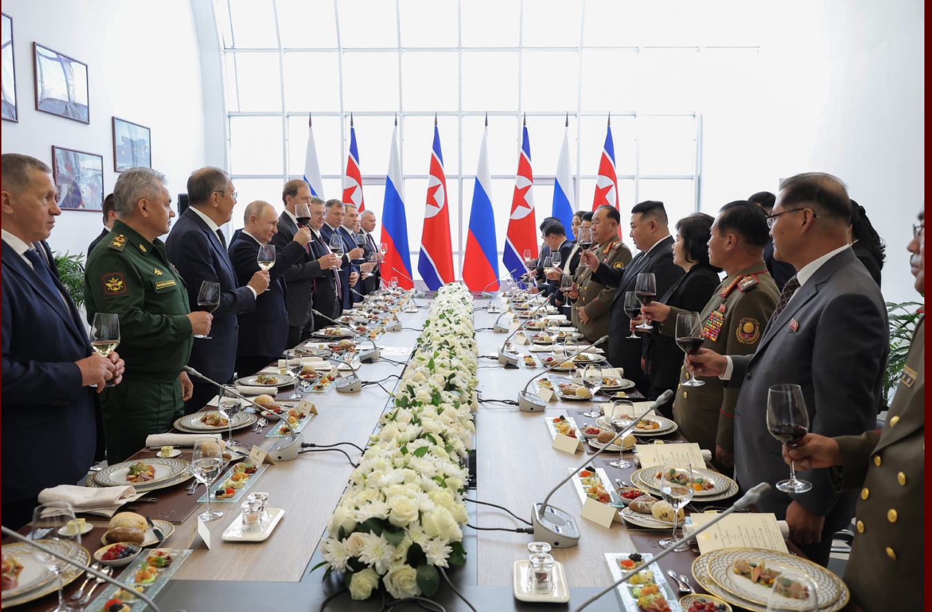
Putin hosts a banquet in honour of Kim Jong Un