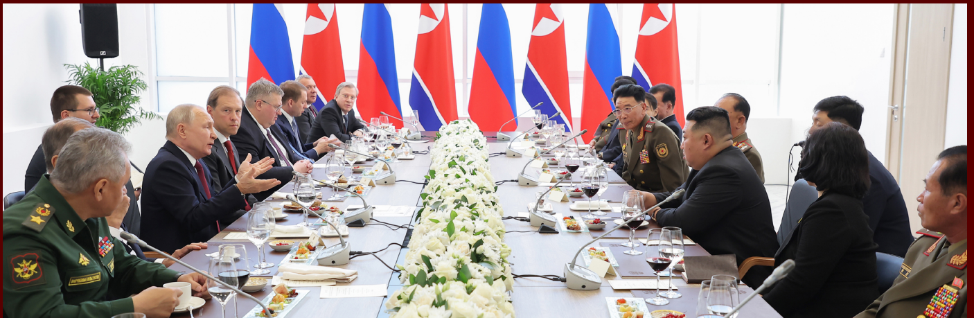
The banquet is going on in a friendly and amicable atmosphere without regard to stereotyped convention