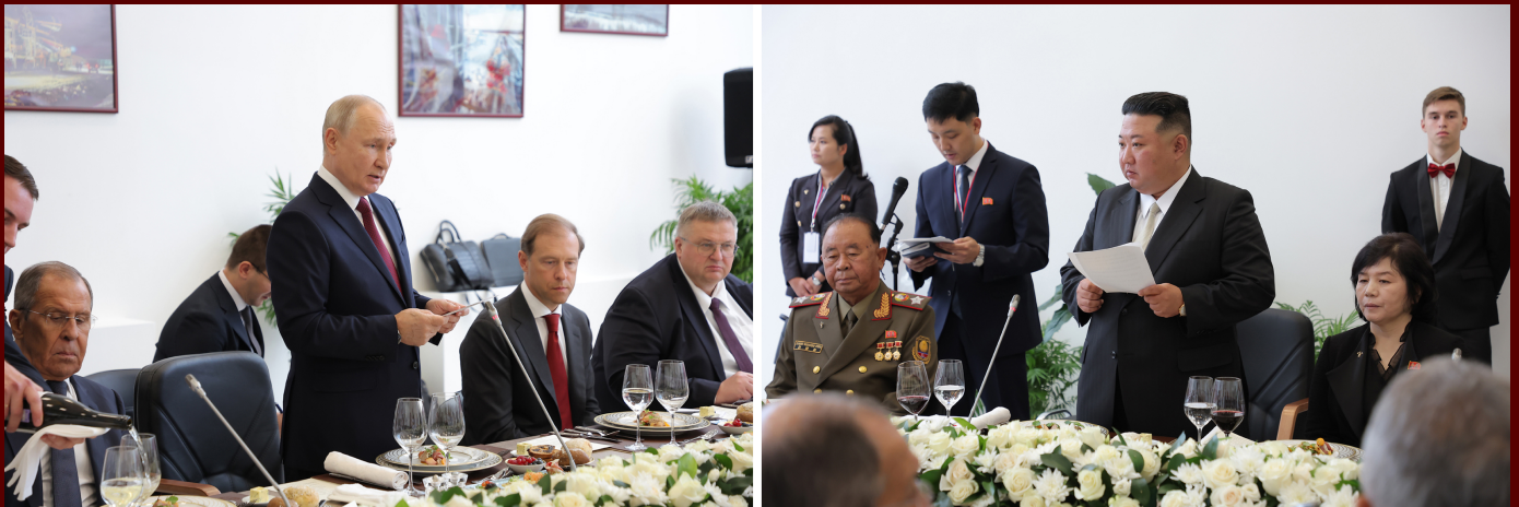
Putin makes a congratulatory speech and Kim Jong Un makes a reply speech