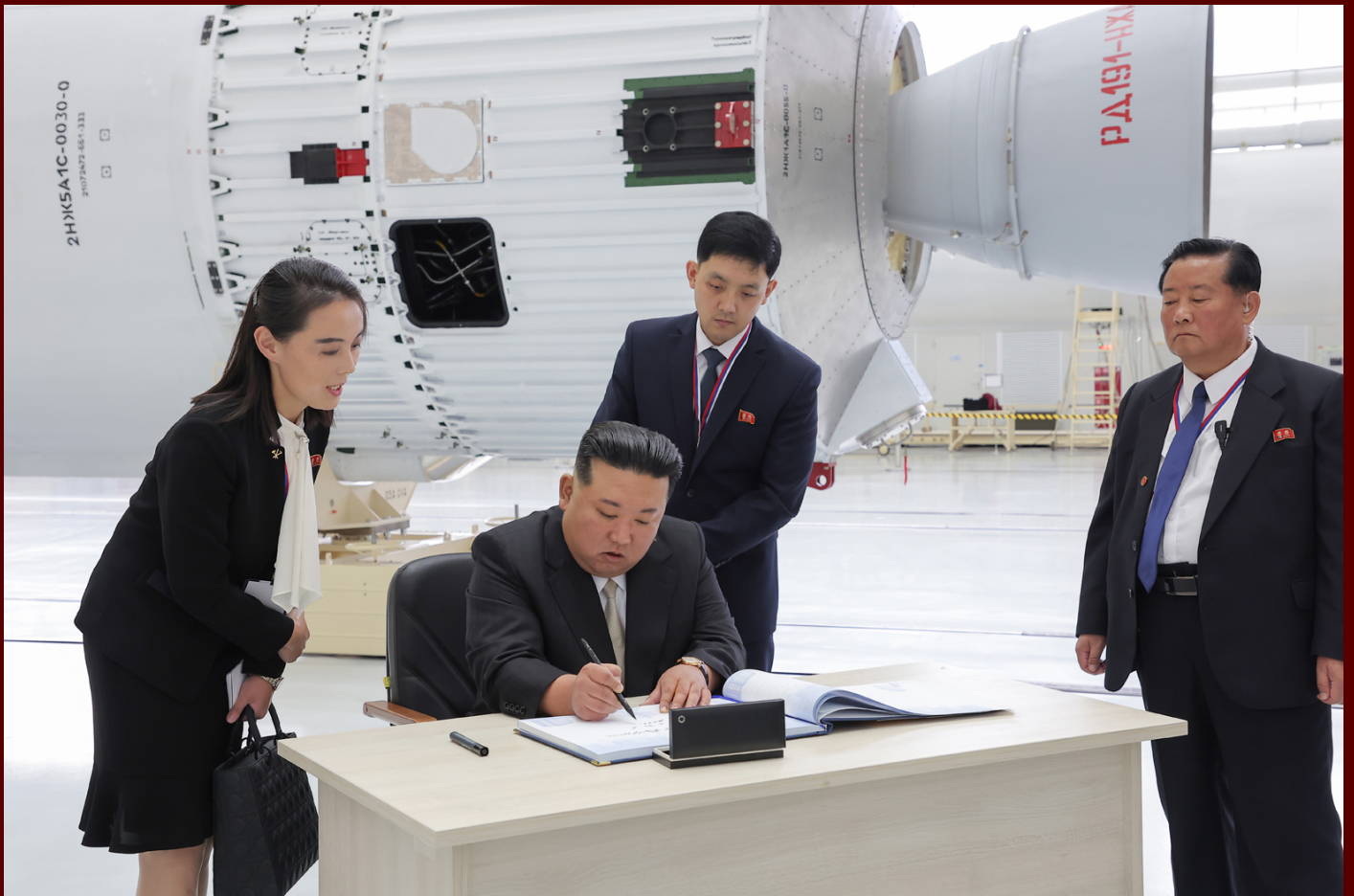
Kim Jong Un writes in the visitors book The glory of Russia that produced the first conquerors of space will be immortal. Kim Jong Un, September 13, 2023