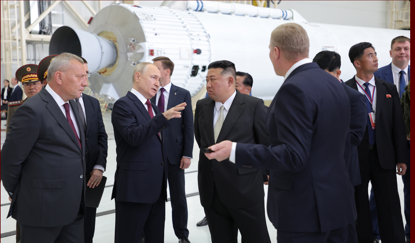
Kim Jong Un, accompanied by Putin, goes round the Vostochny Spaceport