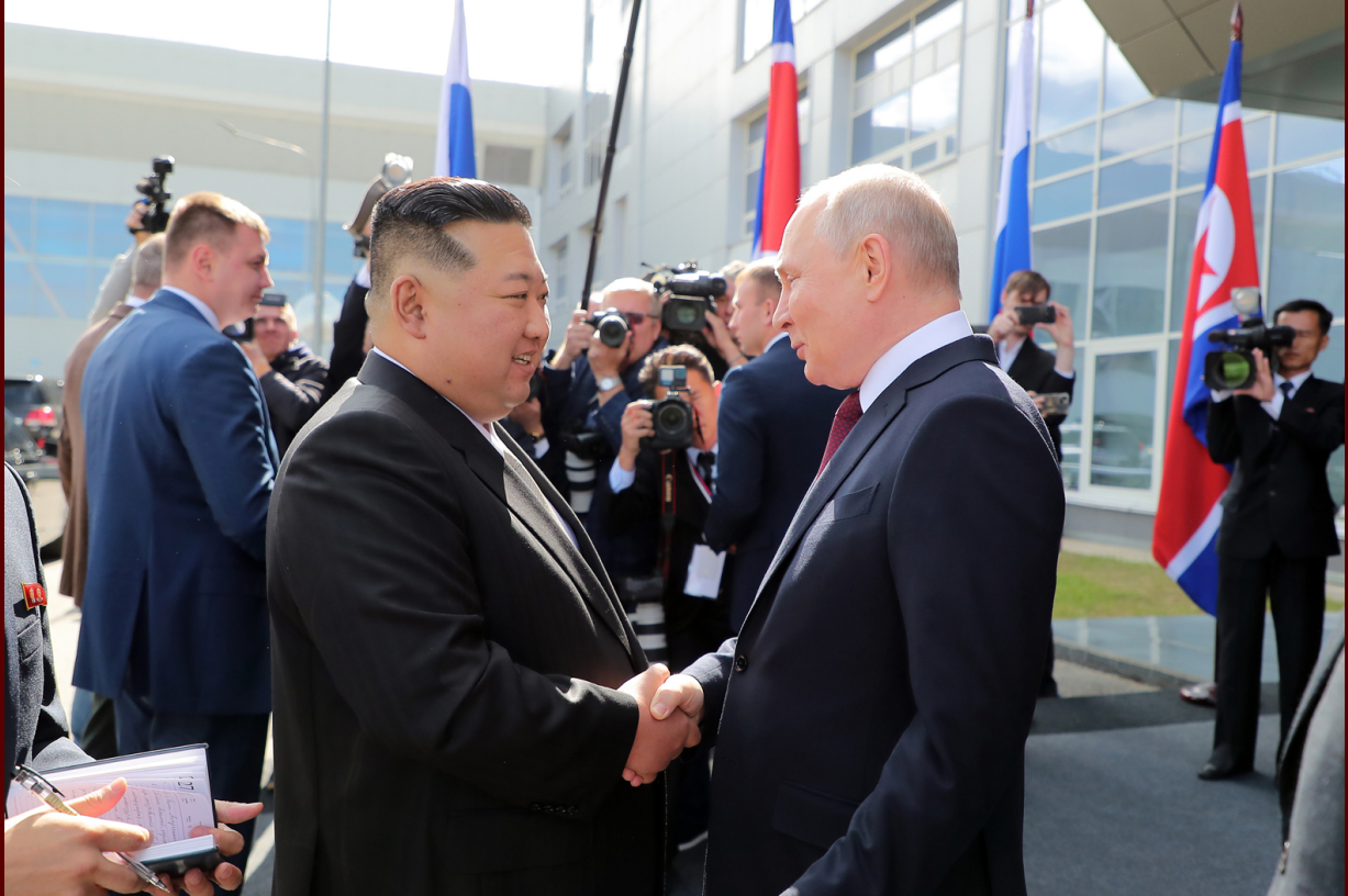
Kim Jong Un, general secretary of the Workers' Party of Korea and president of the State Affairs of the Democratic People's Republic of Korea, meets with Vladimir Vladimirovich Putin, president of the Russian Federation, at the Vostochny Spaceport