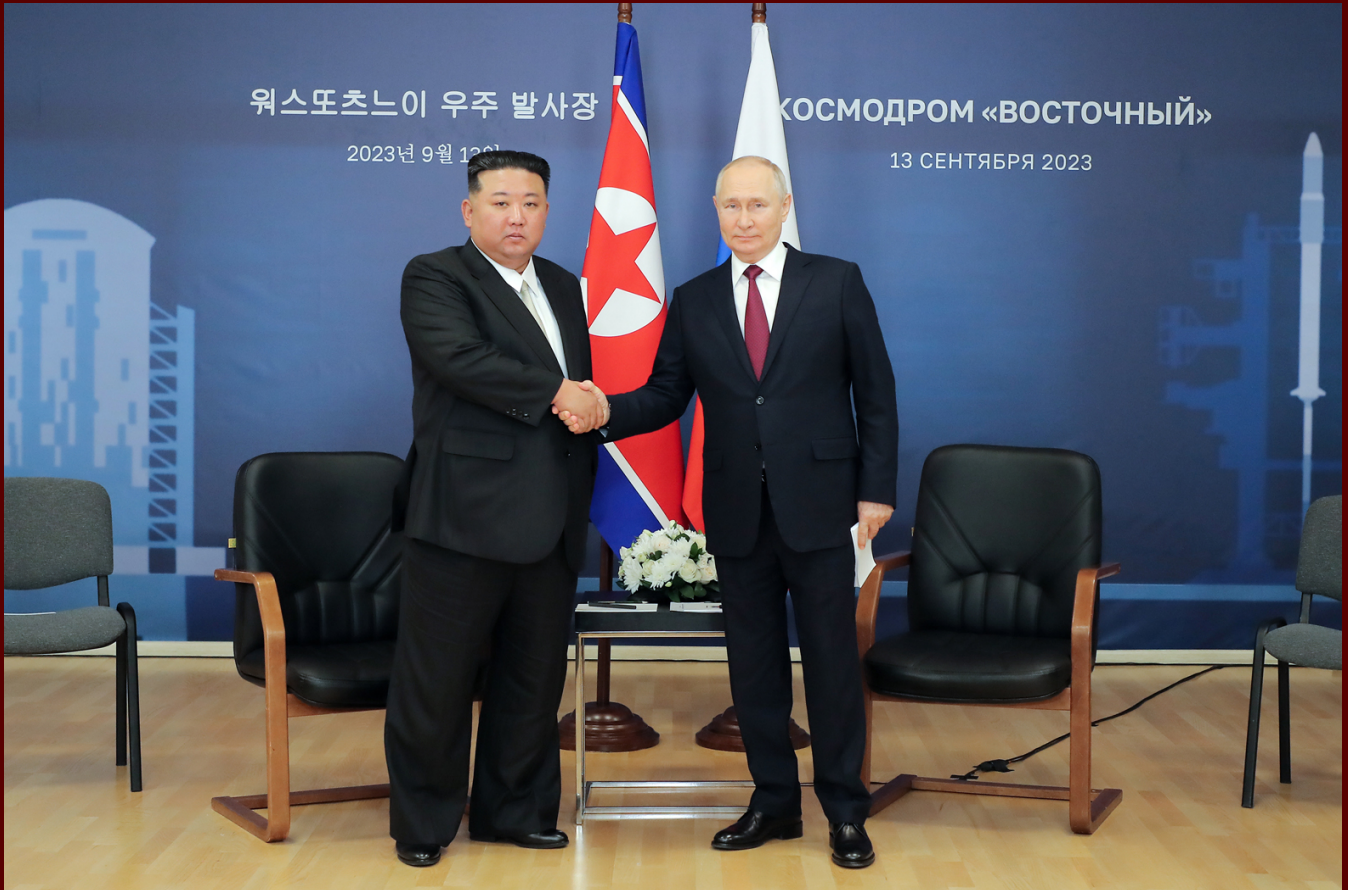
Kim Jong Un has talks with Putin