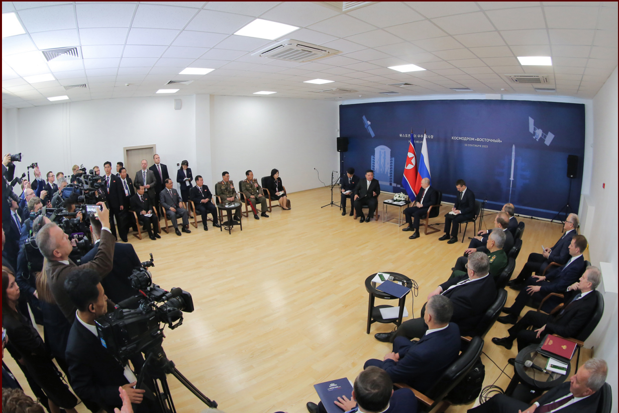
Kim Jong Un has talks with Putin