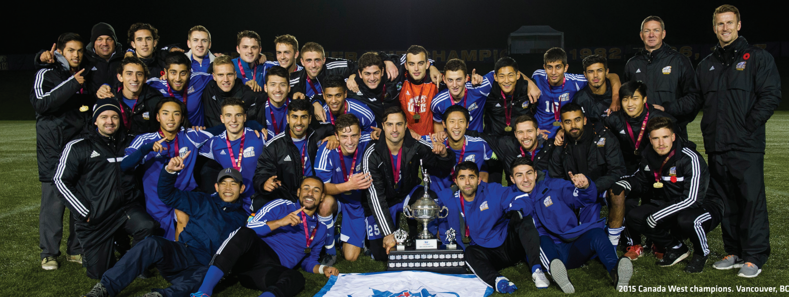
2015 Canada West champions. Vancouver, BC