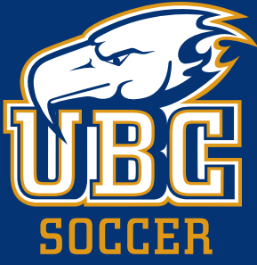
#1 Chad Bush Faculty of Arts