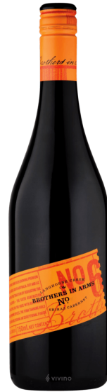
No. 6 Shiraz-Cabernet

Eighteen months in oak has given this wine a vanilla-cedar sheen that blankets the fruit from nose to finish. That said, there's plenty of dark plum and asphalt to support the oak, and a ripe creamy texture that makes the wine easy to drink.