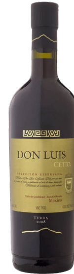
Don Luis Terra

A gem from Mexico! 100% Viognier with a pale gold color, excellent brightness, green and tropical fruit aromas and a floral touch. Unique and long on the palate, with firm acidity and excellent balance.