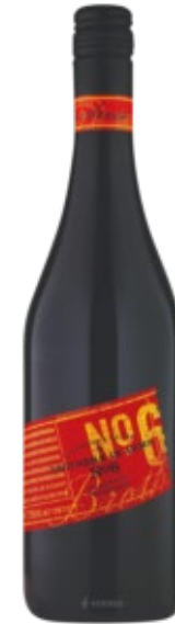
No. 6 Cabernet Sauvignon

Eighteen months in oak has given this wine a vanilla-cedar sheen that blankets the fruit from nose to finish. That said, there's plenty of dark plum and asphalt to support the oak, and a ripe creamy texture that makes the wine easy to drink.