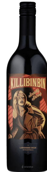
Killibinbin Sneaky Shiraz

One of Australia's best kept wine secrets, this wine shows dark fruit aromas with a pretty hint of plum and violets. The palate is generous, juicy with fine, velvety Petit Verdot tannins providing a delicious lingering finish. A great food wine.