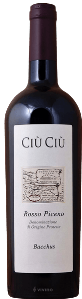
Ciu Ciu Bacchus Piceno

There's so much to love in this big and bold Montepulciano and Sangiovese blend grown on Marche's hills. Cherry, deep dark fruit and some chewy, nutty tannins give this plenty of intrigue. Dry, medium-bodied and harmonious, this one's a crowd pleaser. Unoaked.