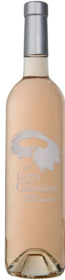
Le Pin de Cadeniere

This amber vermentinu will surprise you with its pronounced tannins, unique freshness and brilliant orange color. A surprising bouquet on the nose and in the mouth with candied fruit (apricot and orange) aromas and a marked tannic presence. Full and round on the palate.