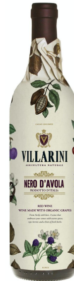
Villarini Nero d'Avola

This wine comes from vineyards that belong to the heart of Tuscany, between Florence and Siena. Made from 80% Sangiovese and 20% Colorino and Malvasia grapes, it shows an intense ruby red, with notes of cherry, plum, black pepper. Intense and smooth