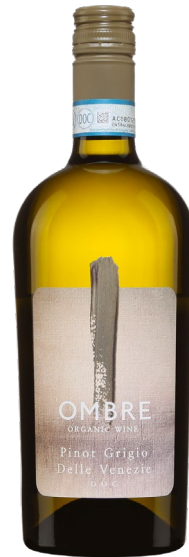
Ombre Pinot Grigio

Delicate perlage and bouquet apple and pear with secondary notes of acacia and lilac. Fresh and light on the palate, balanced acidity and body. 100% Glera., DOC Veneto.