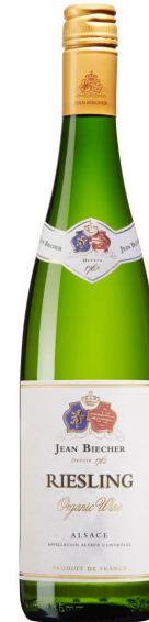
Jean Biecher Riesling

A deep straw yellow color characterizes this organic pinot grigio. The nose is rich in aromas of soft peaches and green apple with a hint of acacia flowers. The palate has a bright freshness and clean minerality.