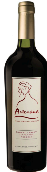
Artesana T-M-Z Blend

On the nose, the predominant notes are white peach and a little honey. Its persistence is medium and its body is light with a lot of freshness. It presents with juicy acidity and mineral and fruity notes.