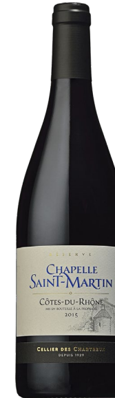
Chapelle Saint Martin

Located in the capital of the Côtes-du-Rhône region, since 1929, the 81 cooperatives of Cellier des Chartreux have created a precious patchwork of sensational wines with respect, enthusiasm and creativity!