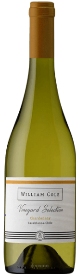
Wm Cole Chardonnay

On the nose, the predominant notes are white peach and a little honey. Its persistence is medium and its body is light with a lot of freshness. It presents with juicy acidity and mineral and fruity notes.