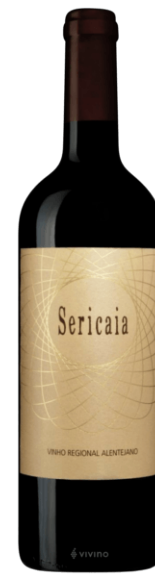
Sericaia Regional Red

From the Alentejo region in southern Portugal, this fresh, silky white has clean flavors of lime sorbet, pear, mango and tropical fruits and a touch of salinity.