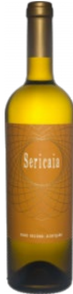
Sericaia Regional White

Aromas of Bartlett pear and lemon zest with a complex palate offering flavors of grapefruit, lemon-lime, freesia and high acidity. It is refreshing in the mouth and offers a splash of orange on the finish.