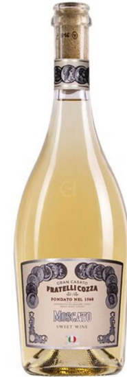
Fratelli Cozza Moscato

Pale yellow color with golden reflection and fine bubbles. Nose of spring flowers and tree fruits. Lively palate with notes of Granny Smith apples. Great as an aperitif. Blend of 90% Mauzac, 5% Chenin Blanc, and 5% Chardonnay grapes.