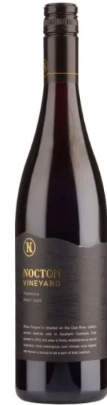
Nocton Pinot Noir

This carefully structured Cabernet has blackberries, wild fennel and a delicate touch of red fruits. A savory palate with red currants and elegant tannins build to a lingering finish. Pair with steak and fragrant mushrooms.