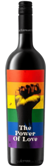
The Power of Love

The nose reveals plenty of cherry and grenadine aromas with a touch of herbs. Nice acidity and moderate tannins hold fresh fruit and grass flavors. It has a medium finish with subtle berry notes.