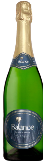
Balance Boldy Brut

Light cherry color with small perlage. Notes of strawberry and blackberry with a touch of citrus. Structured and creamy with refreshing acidity.