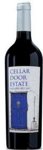
Cellar Door Old Vine Red

Another wine from southern Portugal, the Sericaia red is a deep purple color with a backbone of tangy, firm tannins and concentrated flavors of black plums, blueberries, lemon pith and sweet oak.