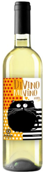
Divino Minino Verdejo

Aromas of Bartlett pear and lemon zest with a complex palate offering flavors of grapefruit, lemon-lime, freesia and high acidity. It is refreshing in the mouth and offers a splash of orange on the finish.