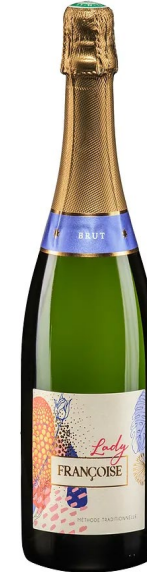
Lady Françoise Brut

A drier style of bubbly, with lingering flavors of tropical fruit, green fig, lime, pear and a light note of butter. Creamy, fresh and well-balanced. 100% Sauvignon Blanc from the Western Cape of South Africa.