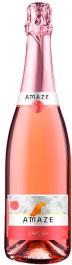
Amaze Rose Pinot Noir

Light cherry color with small perlage. Notes of strawberry and blackberry with a touch of citrus. Structured and creamy with refreshing acidity.