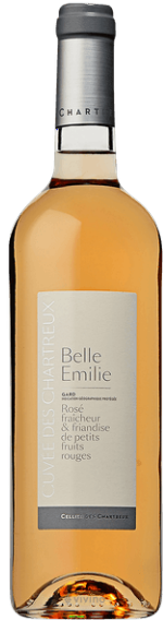
Cuvee Bacchus Rose

Fresh and fruity rosé wine made from grenache and cinsault grapes. Notes of black currant, raspberry, strawberry in the bouquet. Fruity, delicious on the palate, with aromas of red berries. To serve around 10-13°C