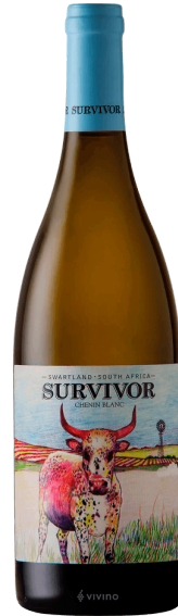
Survivor Chenin Blanc

This wine has an electric pink glow, a nose of fresh herbs de Provence, watermelon and orange zest and lovely acidity. Flavors of raspberry, cranberry and watermelon all unified by a slate like minerality.