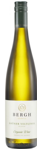
Bergh Gruner Veltliner

A classic Alsace Riesling brimming with citrus notes, lemon curd, crisp green apple, slate-like minerality and refreshing natural acidity. Great with tangy tomato and vinegar- based foods.