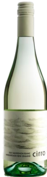
Cirro Sauvignon Blanc

Purple Reign is a blend of 60% Sauvignon Blanc and 40% Semillon grape varieties, infused with organic natural botanicals to minimize the use of sulphites and to create a unique new color and vibrancy. Expect a hint of grass and a touch of minerals.