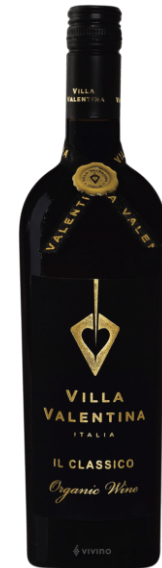
Viva Valentina Il Classico

A premium organic wine that boasts a range of classic Italian aromas, including cherry, blackberry, and plum, with subtle hints of herb and sage. From the famed Sicilian Botter Family, aging for 10 months in new and old oak barrels gives it a touch of leather and vanilla,