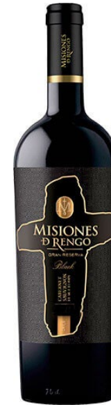
Misiones D Rengo Black

Cherry and licorice with hints of toasted oak shape the nose of this blend. This is a full-bodied wine with chewy tannins and good acidity. It has concentrated tart cherry and red plum with hints of blackberry jam.