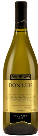
Don Luis Viognier

A gem from Mexico! 100% Viognier with a pale gold color, excellent brightness, green and tropical fruit aromas and a floral touch. Unique and long on the palate, with firm acidity and excellent balance.