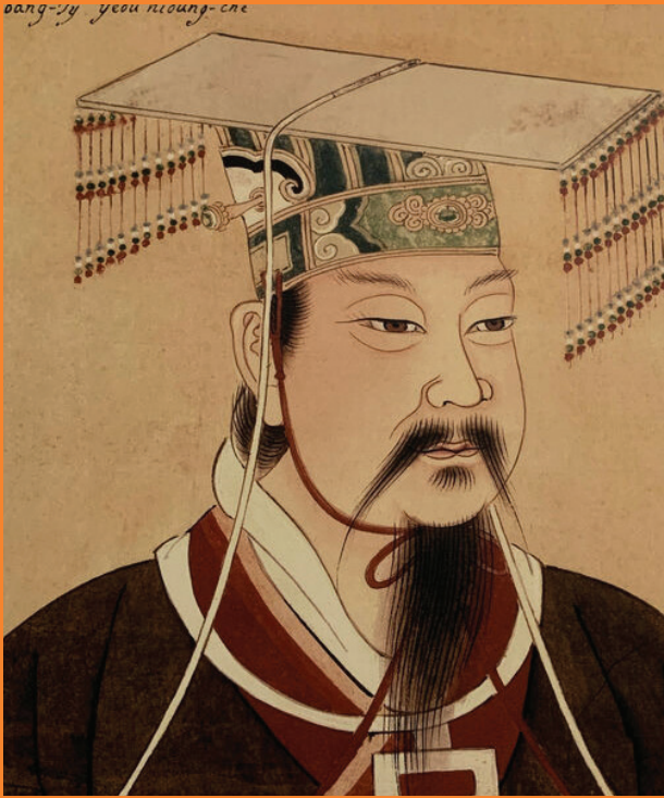
Cover image: A painting of Huang Di, the Yellow Emperor. Print: of Huang Di