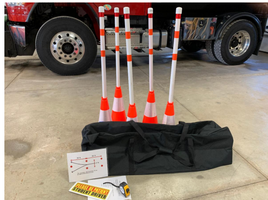
Maneuverability test kit available for use at Berkshire Township Hall 1454 Rome Corners Road

The earliest you may get your temporary learning permit is at 15 ½. This step requires going to the Bureau of Motor Vehicles (BMV) and taking a written exam and eye exam and passing both. To then get a probationary driver license, you must enroll in and complete a driver education program at a licensed driver training school which includes 24 hours of classroom and 8 hours of driving time. You must also Complete 50 hours total of driving, with at least 10 hours of night driving with a parent or guardian. And teens must hold the temporary permit for at least six months. Once all these steps are completed you may apply for your probationary driver's license. This will require you to pass a written and verbal evaluation along with successfully performing a maneuverability test.