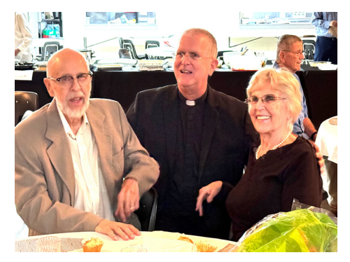
events, it's great to know they are both where they should be - with family.

Over 80 friends and family were there to say goodbye. While we will miss seeing them in person at our