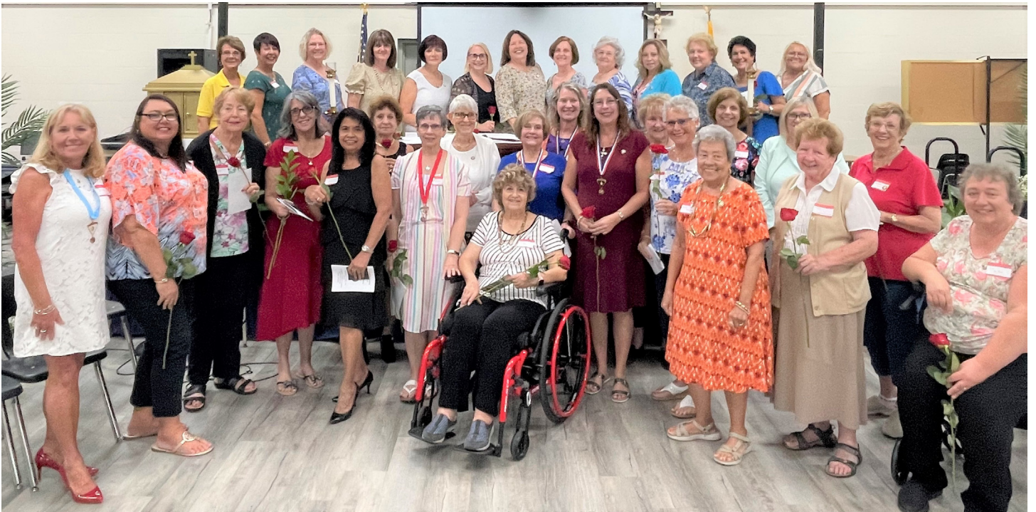
The new Columbiettes and dignitaries