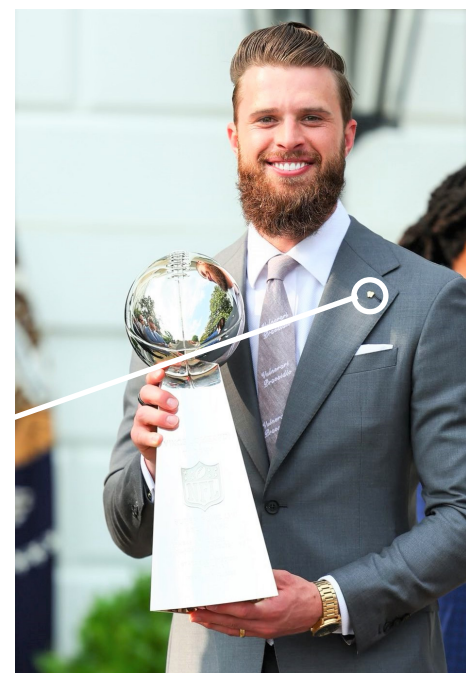
Harrison Butker, holding a Super Bowl trophy.