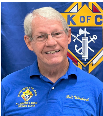
of Christ Parish in Clearwater (25