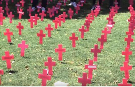
One Cemetery of the Innocents

Students for Life of America's Cemetery of the Innocents is waking people up to the reality of abortion. By displaying pro-life crosses at select locations throughout the country, this peaceful demonstration reminds the public about the numerous lives lost to abortion each day.