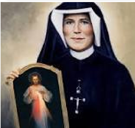
Saint Faustina Kowalska

The Divine Mercy devotion as we practice it today came from Saint Faustina Kowalska, a Polish nun who lived in the early 20th century. She claimed that she had regular visions of Jesus and saints and that Jesus himself gave her the details of the devotion.