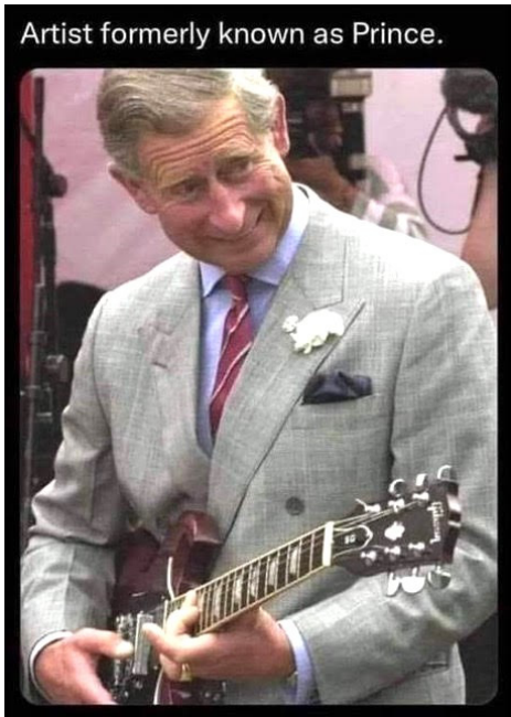
Artist formerly known as Prince.